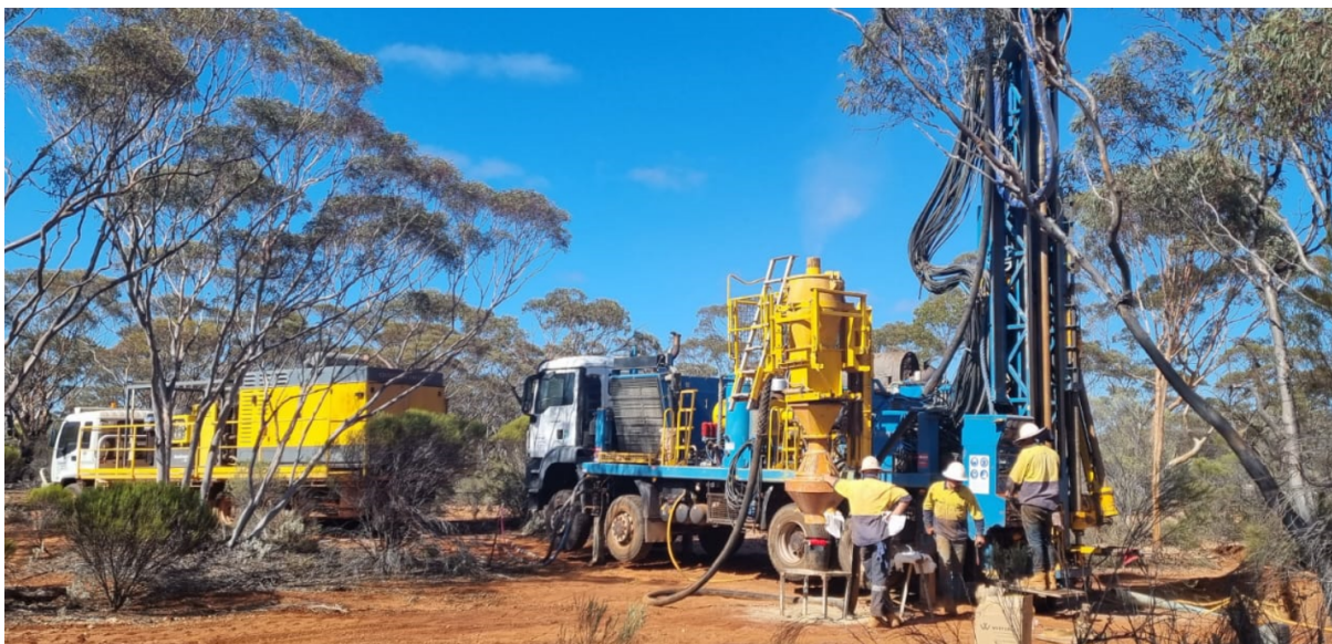
Figure 1 – Lord Resources, RC drilling at the Horse Rocks, south Coolgardie, Western Australia.