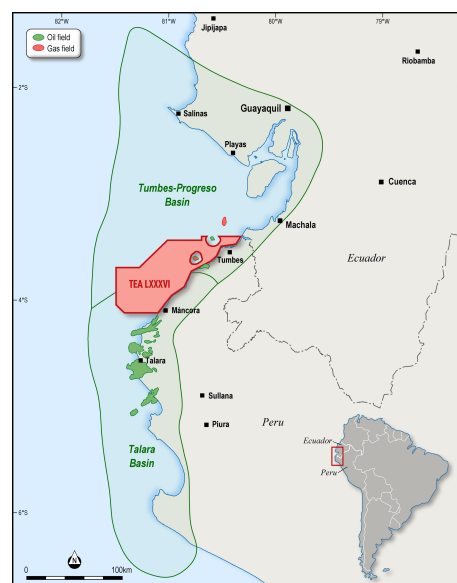
Figure 2: Tumbes and Talara Basins

The southeast end of the block borders the Alto-Pena Negra oil field which is one of Peru's most productive fields, currently producing around 3,000 barrels of oil per day (bopd) with total historical production of more than 143 million barrels of oil. In