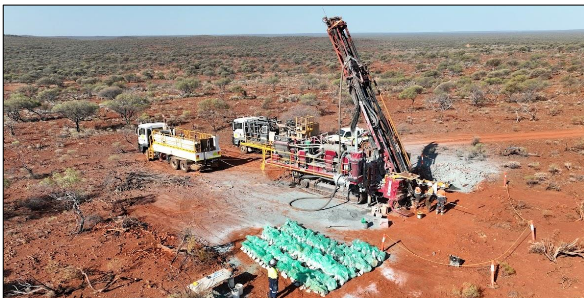
Figure 2: Drilling currently underway at Rothschild.