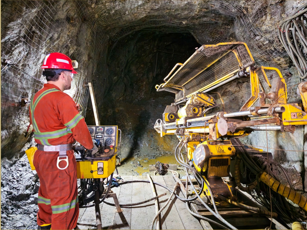
Photograph of the Atlas Copco Diamec U6 drill rig underground on the 55L at the Ming Mine (16 October 2023)

“This means we have two exceptional avenues for resource growth. The drilling is aimed at unlocking these opportunities in a timely manner”.