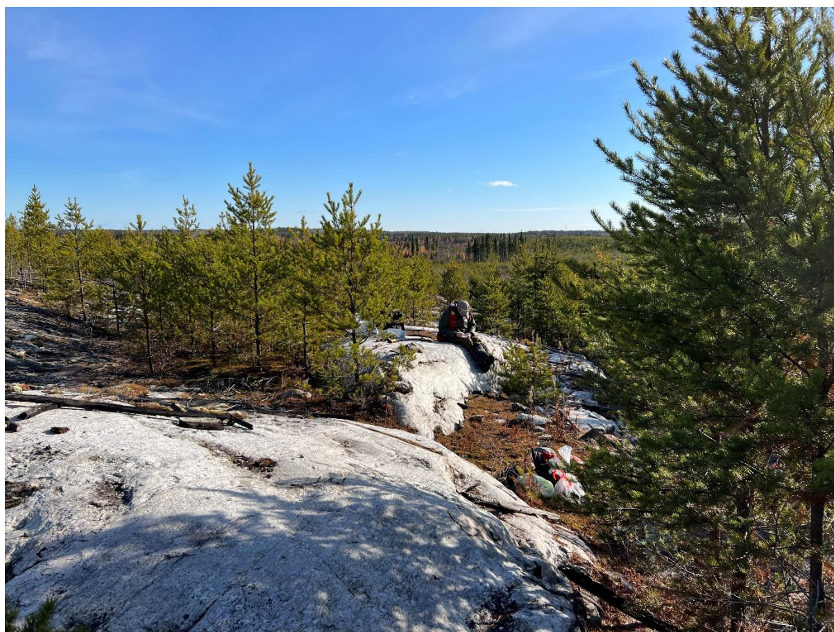
Figure 2: Exploration geologist on a pegmatite outcrop at Berens Property.

The Bearhead Lake fault zone is a major crustal break hosting numerous large two-mica granite intrusions with associated spodumene-bearing pegmatites. Frontier Lithium's claims, hosting the PAK Project, is located along the same crustal break, directly adjacent to the Midex claim package. The strong spatial alignment of pegmatite-hosted lithium deposits and occurrences parallel to the NW-SE-striking Bearhead Lake fault zone is what gave the district the name 'Electric Avenue'. With the Berens Transaction, Patriot now controls almost 900km 2 directly along and surrounding the Bearhead Lake fault zone.