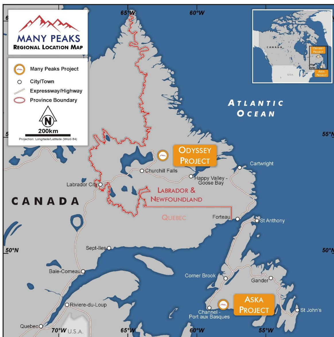
Figure 3: Location Map