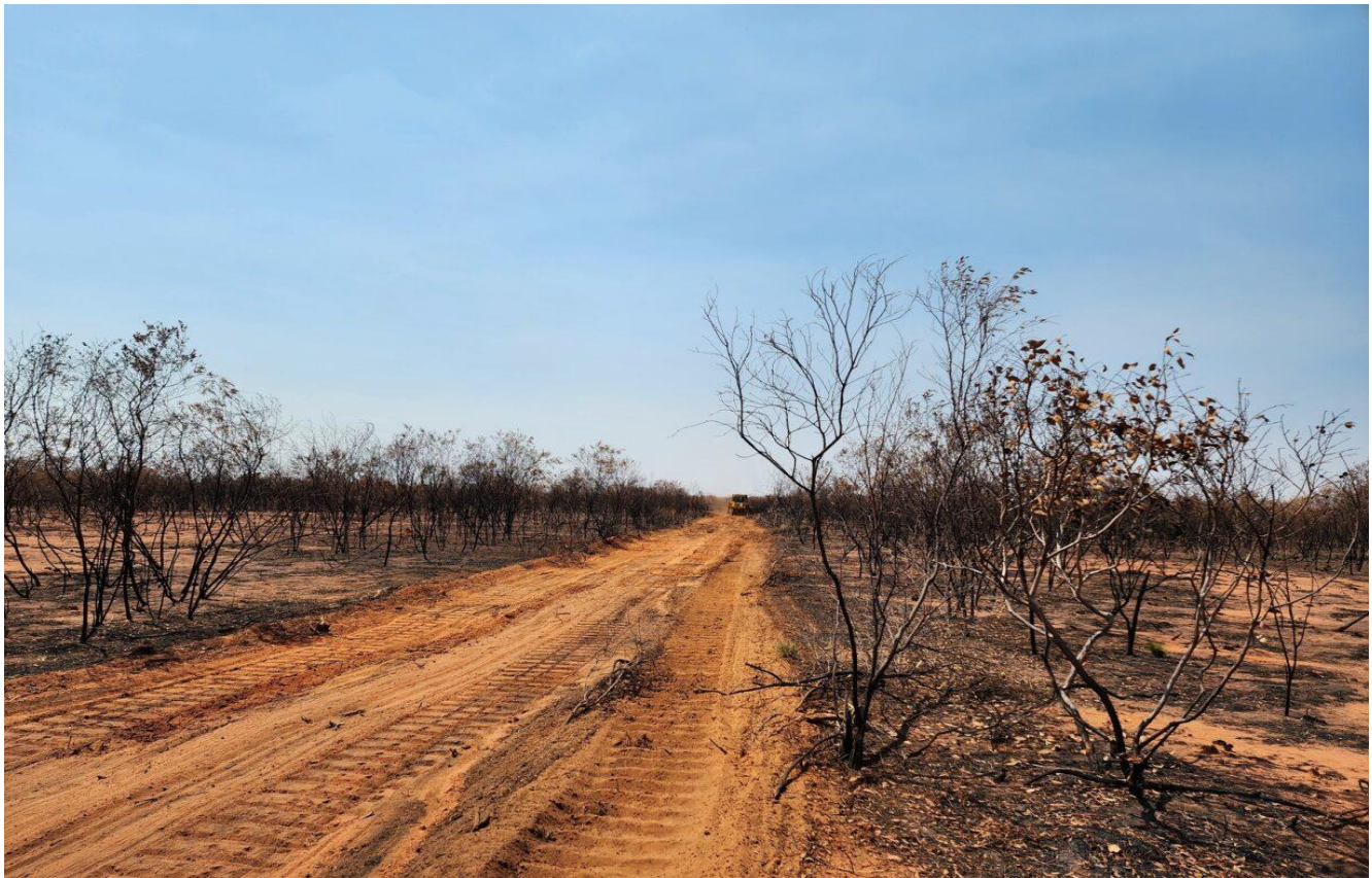
Figure 3: Main Access track through Frewena Fable tenement

The attached photographs (Figures 3) also show some of the access track that has been completed and the Company now has excellent access, throughout the whole of the Frewena Fable tenements (Figure 4), which will significantly improve the ability for future field exploration of what are strong targets on this tenement.