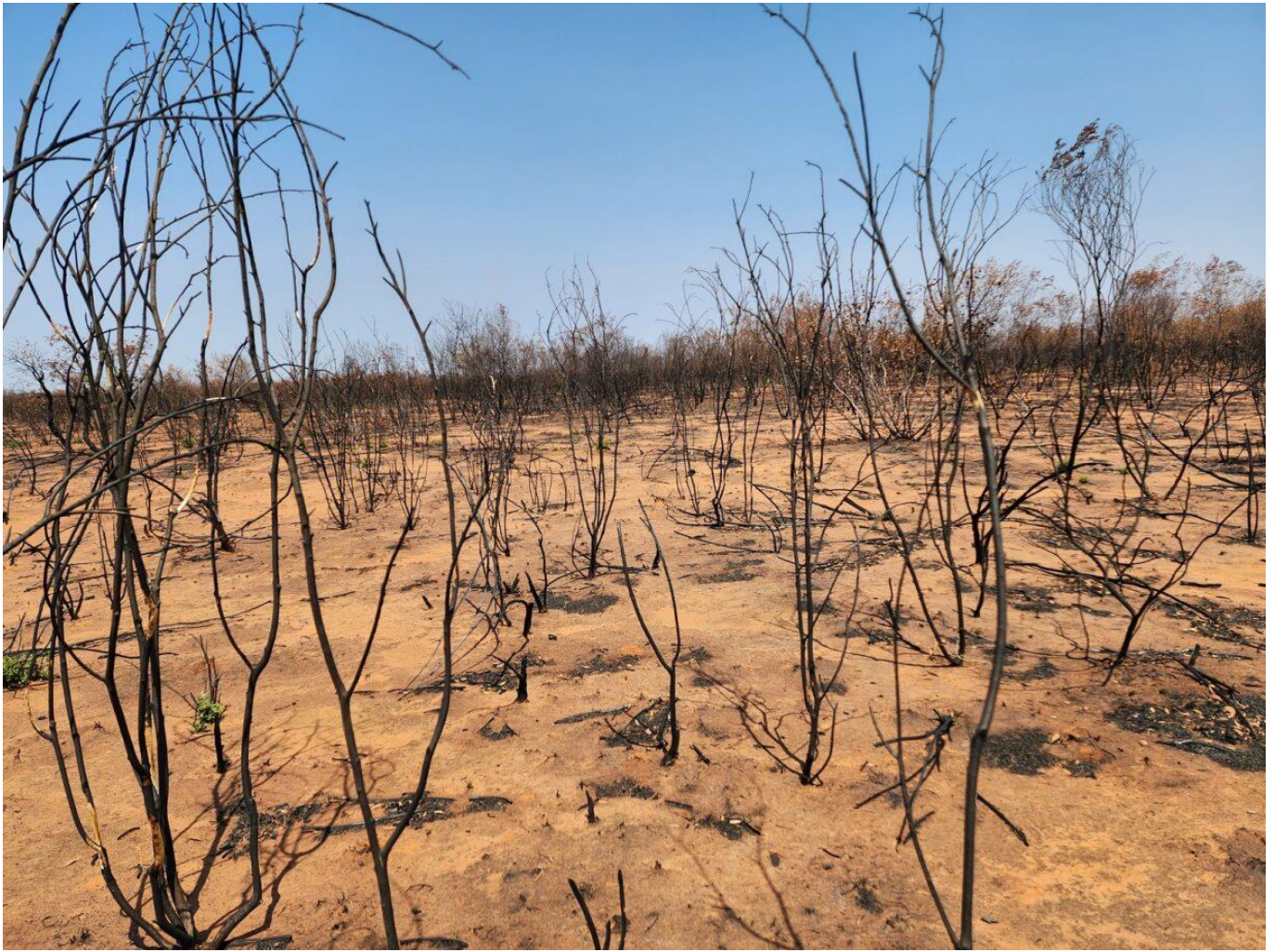
Figure 2: Frewena Fable area after recent major fire, showing full extent of fire damage