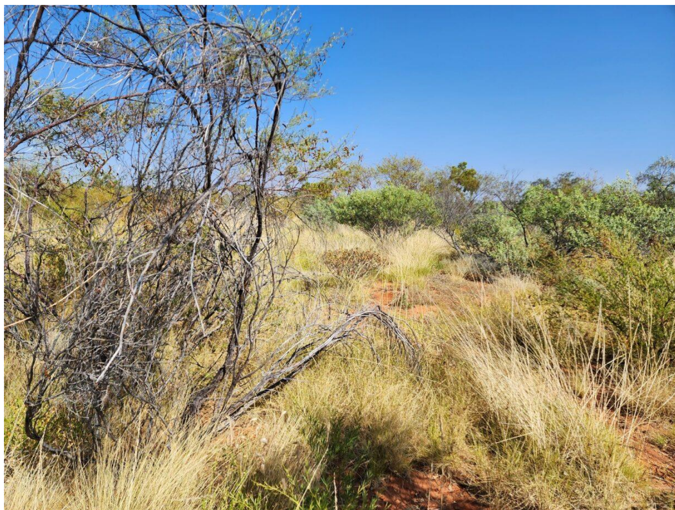
Figure 1: Normal pre-fire vegetation cover in Frewena Fable area

The impact of the fire is profound as can be seen from the photographs showing the nature of the vegetation and scrub cover in the area before the fire (Figure 1) and the devastation of this following the fire (Figure 2).