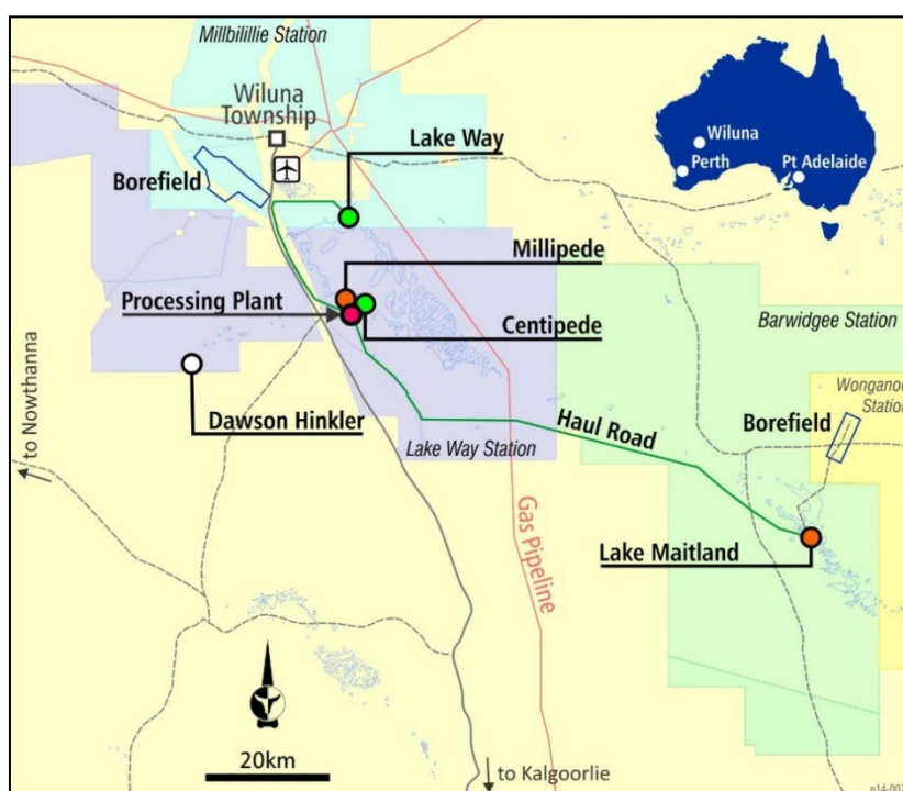
Figure 1: Wiluna Uranium Project

During the year the Company finalised a Scoping Study ( Study ) for the proposed stand-alone Lake Maitland Uranium-Vanadium operation on its Wiluna Uranium Project, located approximately 105 km southeast of Wiluna township in Western Australia and 730 km NE of Perth ( Figure 1 ). The Study was completed by mining engineers at SRK Consulting Australasia ( SRK ) and metallurgical and processing engineers at Strategic Metallurgy and highlights the project's potential to deliver robust financial returns.