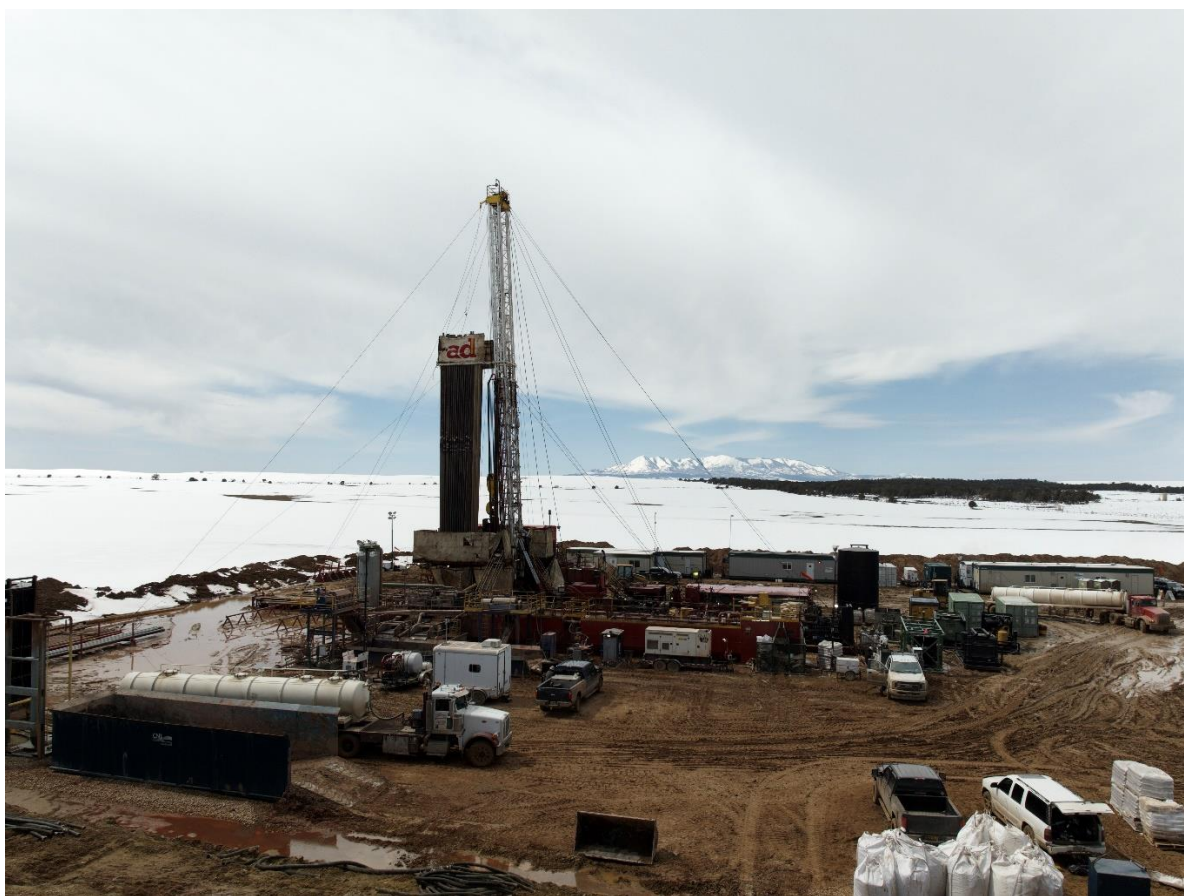
Figure 1: Aztec 1099 Drilling Rig at the Jesse-2 wellsite in SE Utah

The Aztec 1099 drilling rig is currently drilling the 8.75 inch intermediate hole section and has reached the top of the Paradox Formation (salt seal) at 5,928 feet in line with the geological prognosis. The rig is currently tripping to change the bottomhole assembly and condition the mud system before drilling ahead in the Paradox Formation to the top of the Mississippian Leadville Dolomite target.