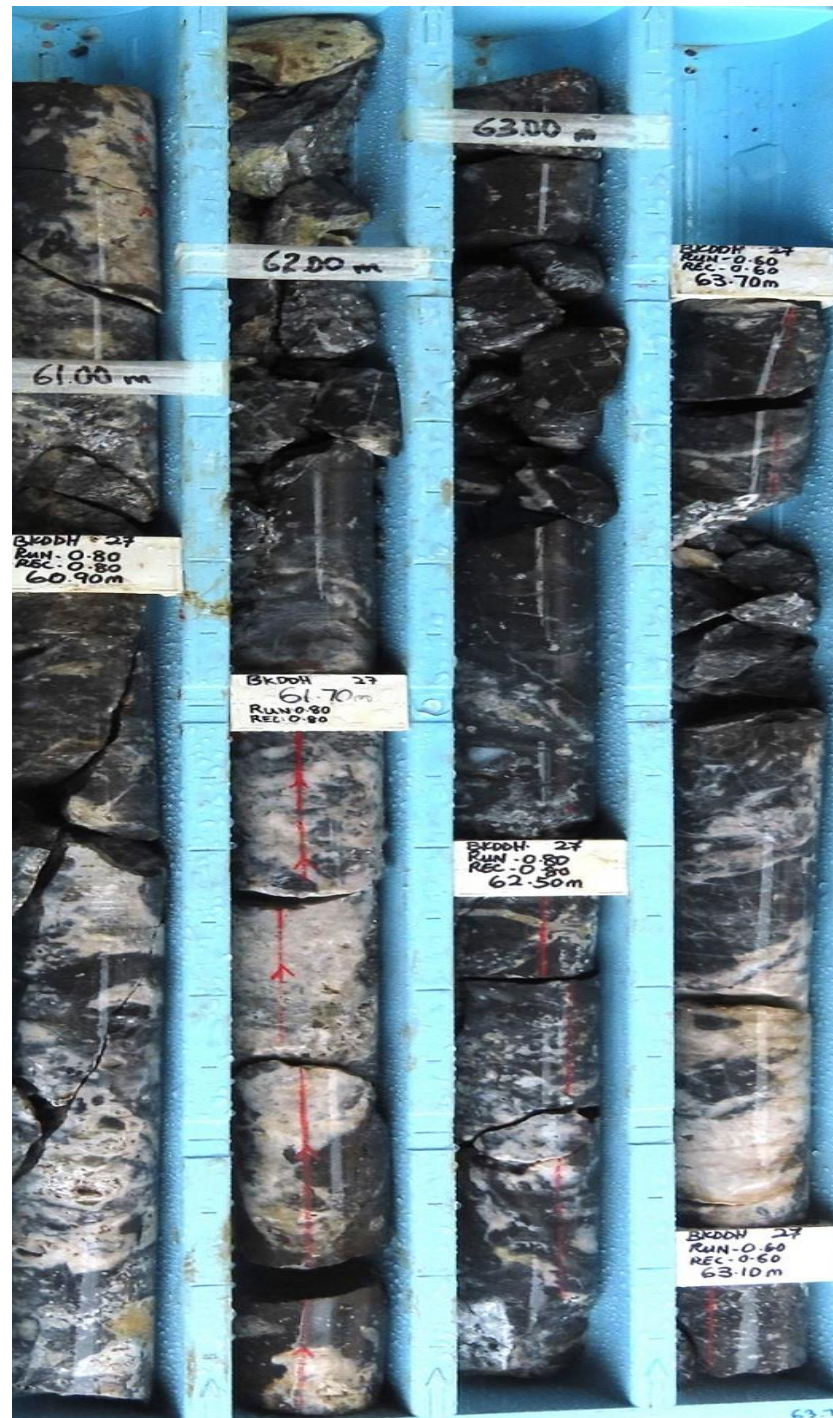
Figure 2: Portion of BKDDH-27 core, between 60.0m-63.7m, illustrating intense alteration in a zone hosting bonanza gold grades: 0.5m @ 209 g/t between 60.5m – 61.0m; 1m @ 64 g/t between 61.0 – 62.0 m; 1 m @ 15.9 g/t between 62.0m – 63.0m & 1m @ 31.8 g/t between 63.0m – 64.0m.