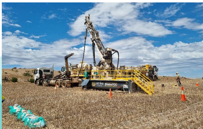
Phase 2 RC Drilling Underway at Lady Sampson

Phase 2 RC drilling has commenced at Lady Sampson, approximately 40km southeast of the town of Northampton. Phase 2 is following up the February RC drill program, which was the first drilling completed in the area. The maiden program was very successful, intercepting high quality base metals mineralisation in the majority of the holes completed. This new program aims to test the grade continuity between the original intercepts, as well as strike and depth extensions. The new program is being drilled towards the west, which should yield an optimal orientation to assess the potential of Lady Sampson.