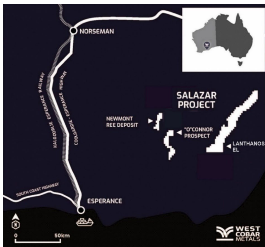
Figure 3: Location of the Salazar REE project tenements