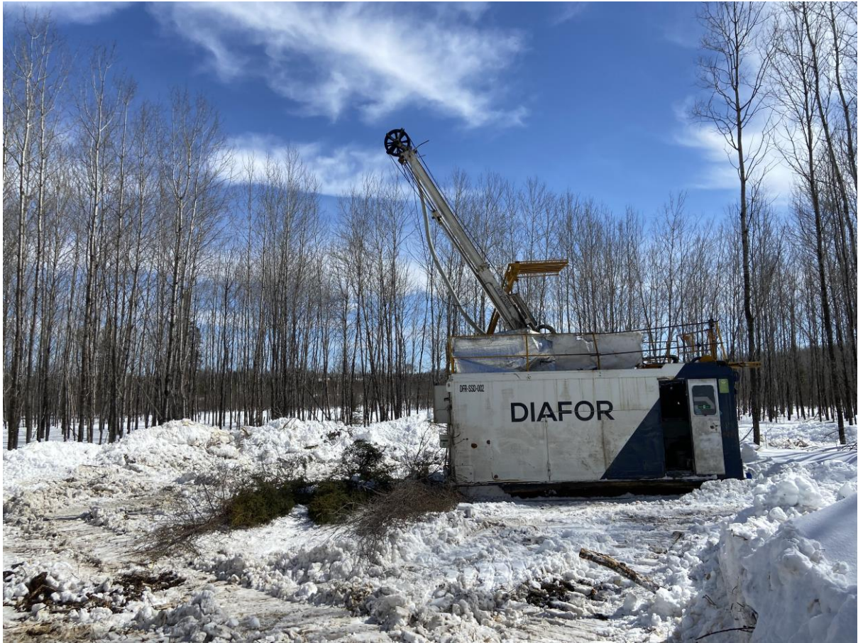
Photo 1: Diafor Drilling Rig in Operation at Chubb Lithium Project Site