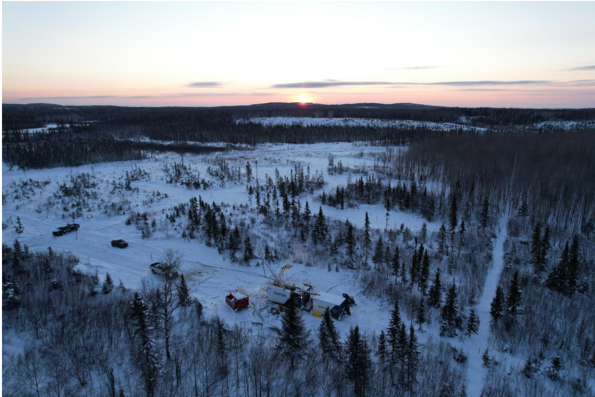
Photo 3: Aerial picture of accessible terrain and Diafor drilling rig in foreground.