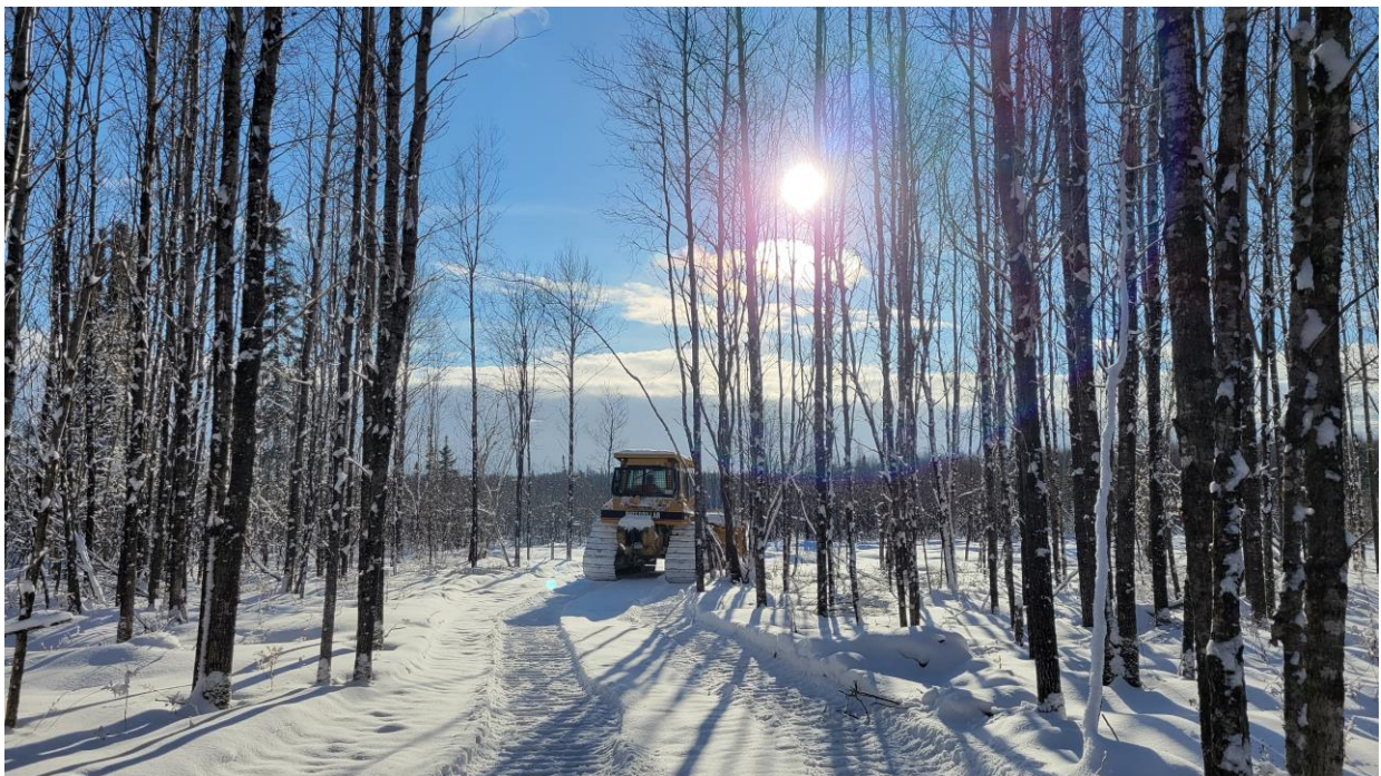
Photo 2: Dozer prepared access tracks and drill pads - Completed in March 2023