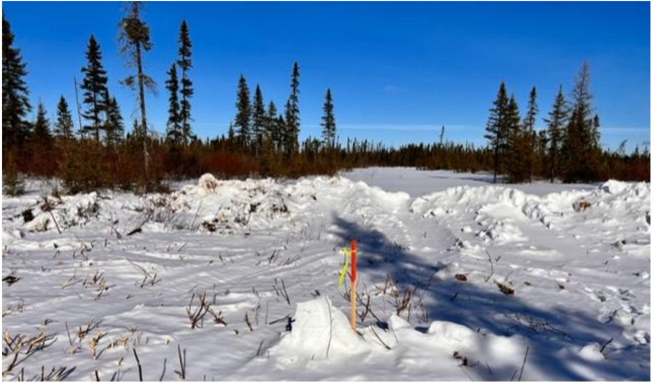
Photo 5: First diamond core drill hole location - Chubb Lithium Project Site