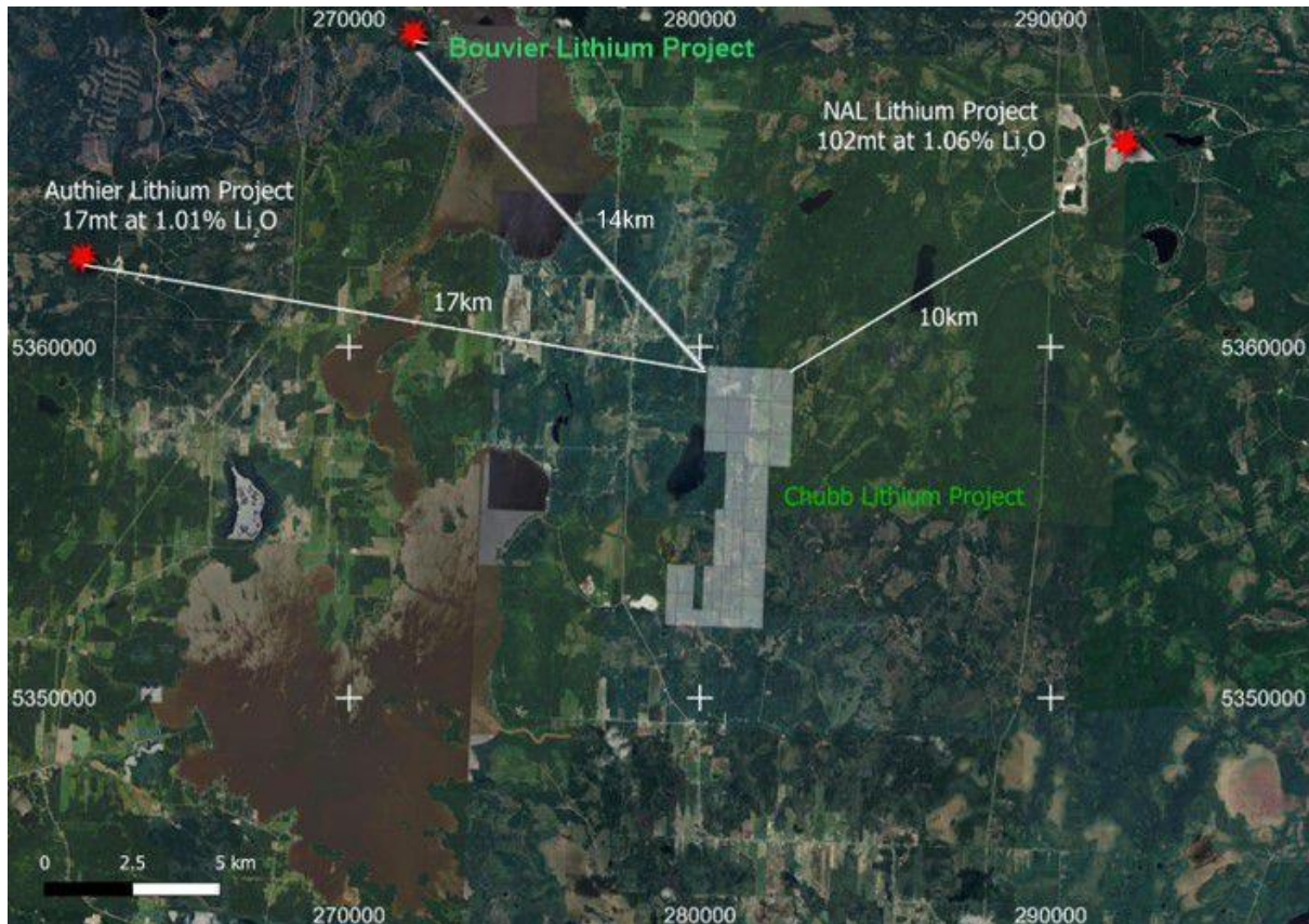
Figure 2: Location map of the Chubb and Bouvier Lithium Projects with respect to the North America Lithium Mine and Processing Plant

Diafor commenced mobilised to site on Tuesday 04 March and commenced the first drill hole on 05 March.