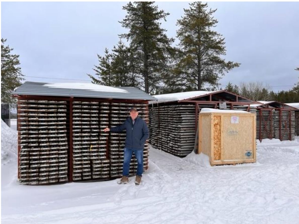
Photo 4 : Chubb Lithium Diamond Core Storage - awarded to MNG in Town of Val-d'Or