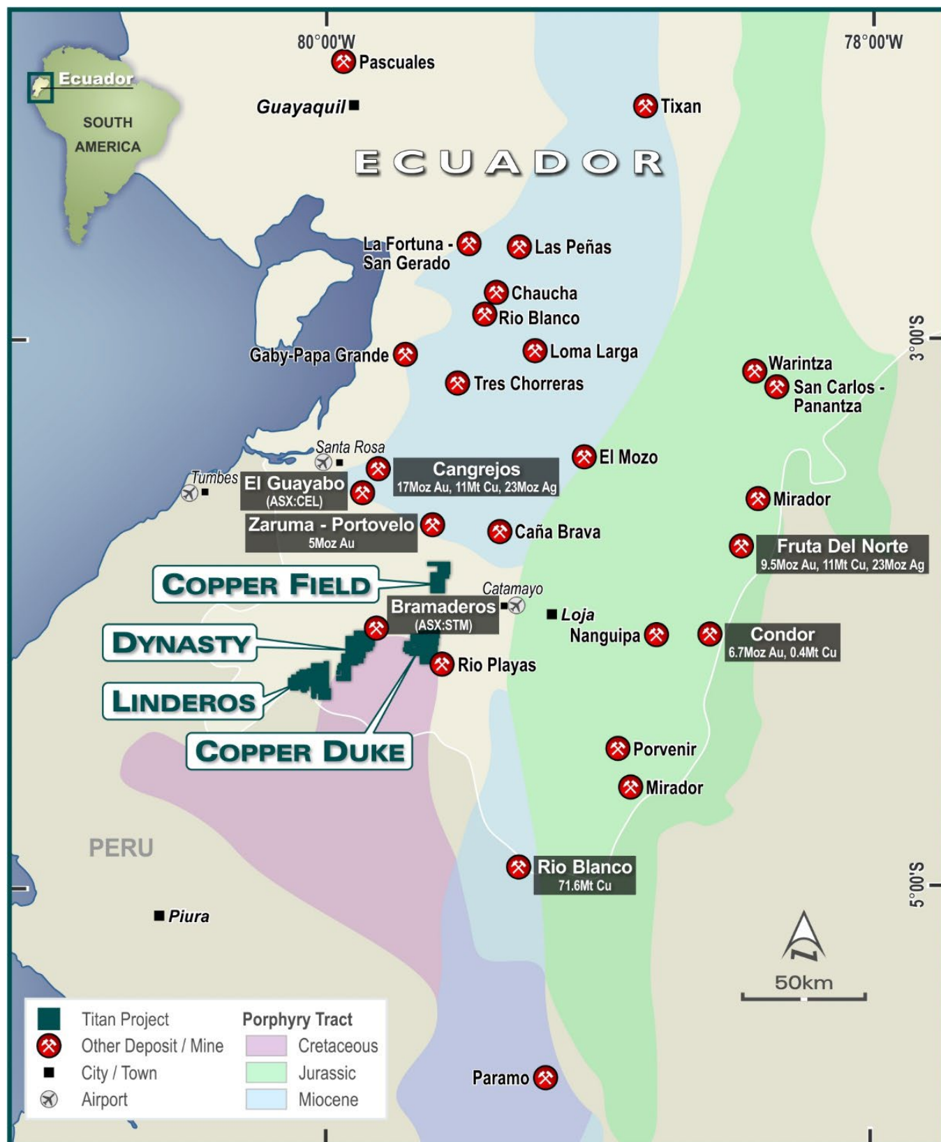
Figure 3: Titan Minerals southern Ecuador Projects, the metallogenic belts of Ecuador and peer deposits