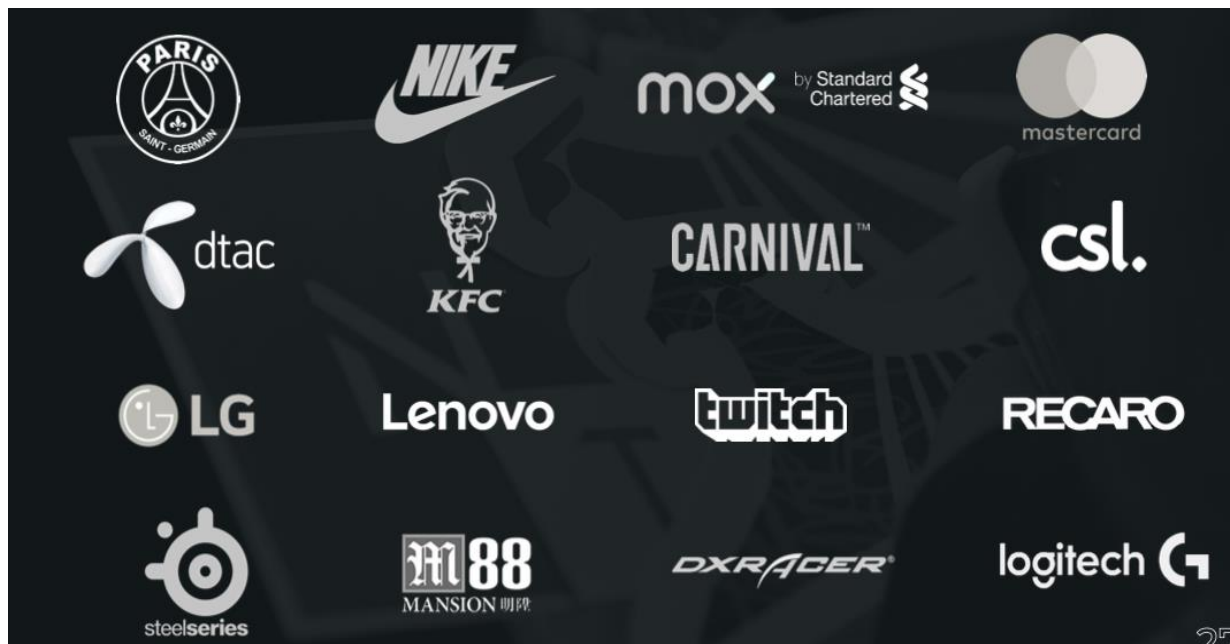
Figure 2: TALON's current client portfolio

TALON works and develops with the leading Web3 platforms and are keen to leverage EsportsHero's proprietary technology in esports prediction and tournament management to enhance their esports offering to their network and clientele.