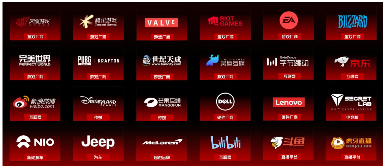
Figure 1. FMWH Global Partners and clients