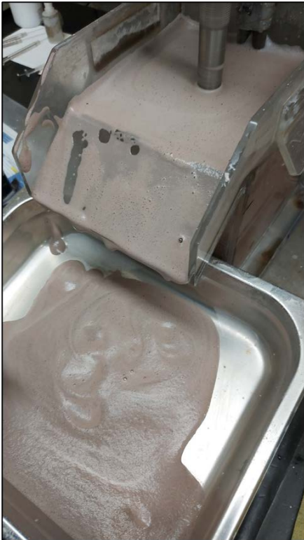
FIGURE 4: METALLURGICAL TESTING – FROTHER PRODUCT EXAMPLE