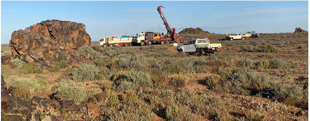
FIGURE 2: DRILLING UNDERWAY AT BHA PROJECT'S EAST ZONE

Location: 6460000mN, 570000mE