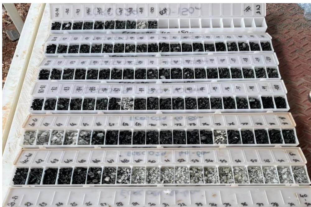
Figure 2 - Drill chips of the drill hole ECRC029