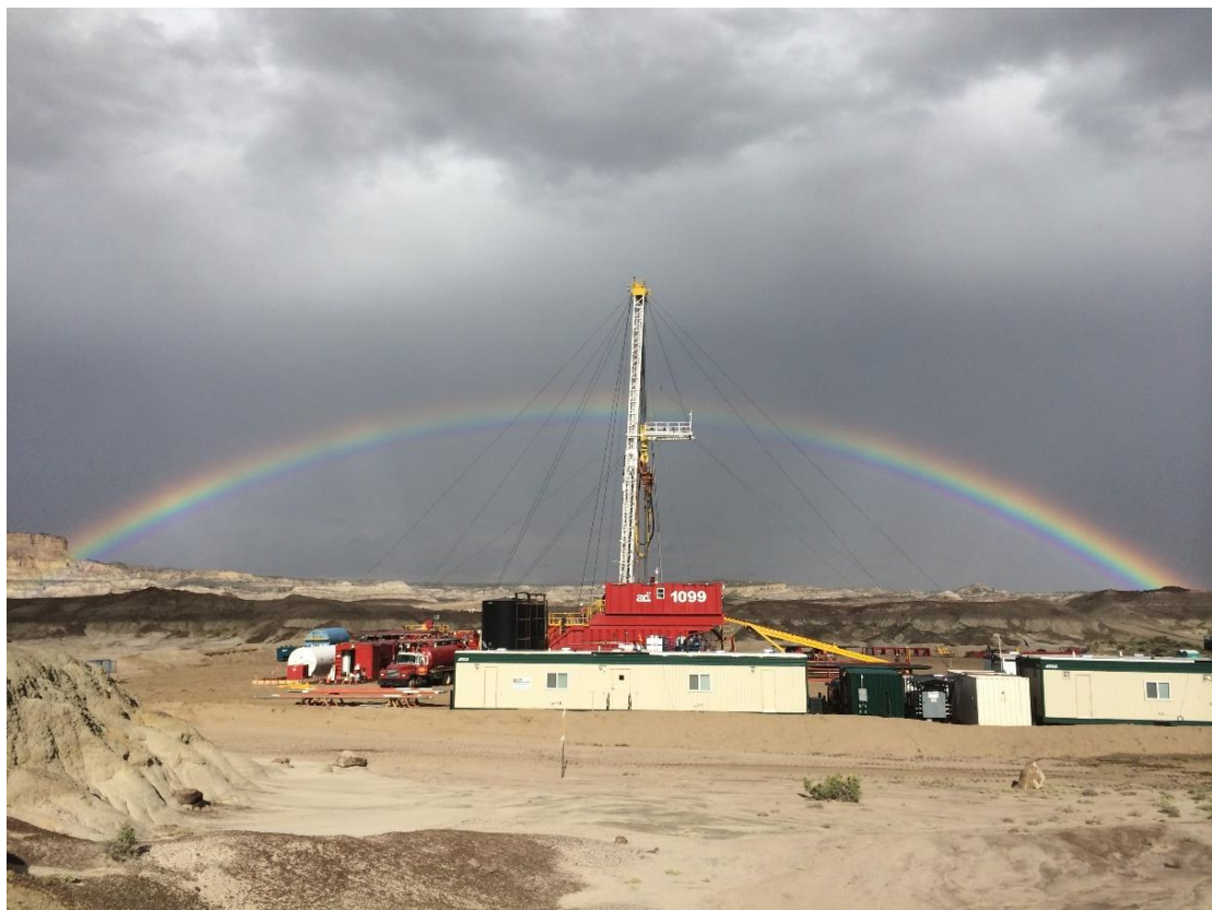
Figure 1: Aztec 1099 Drilling Rig

The Aztec 1099 drilling rig spudded the Jesse-2 helium well on 14 March 2023, and has reached total depth for the 12.25” surface hole section at 3135 feet. The rig is currently running the 9.625” casing before drilling the 8.75” intermediate hole section. The Jesse-2 well is anticipated to take approximately a month to reach the projected total depth of 8150 feet true vertical depth subsea in the middle Mississippian Leadville Dolomite formation.