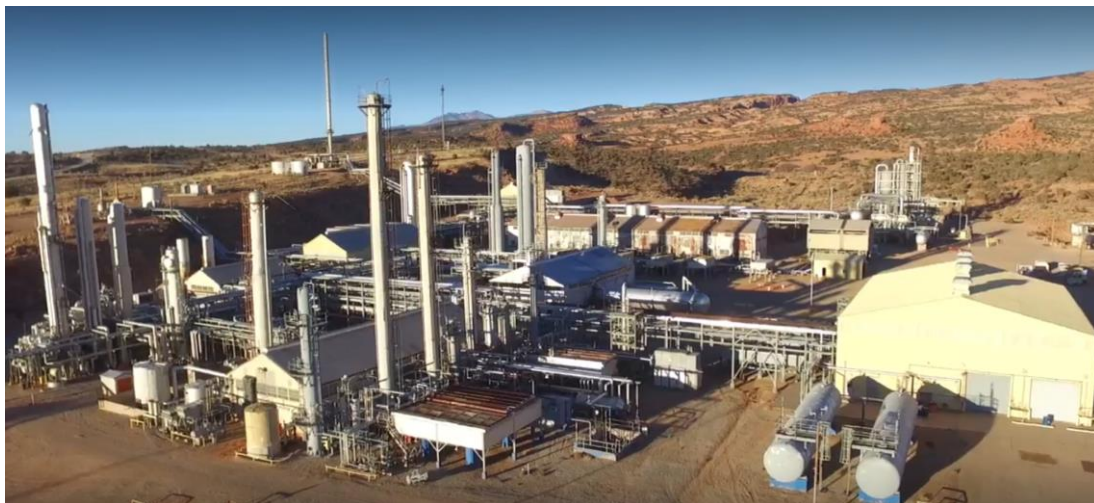
Figure 3: Paradox “5.5 Nines” Resources Lisbon Valley Gas Processing Plant.