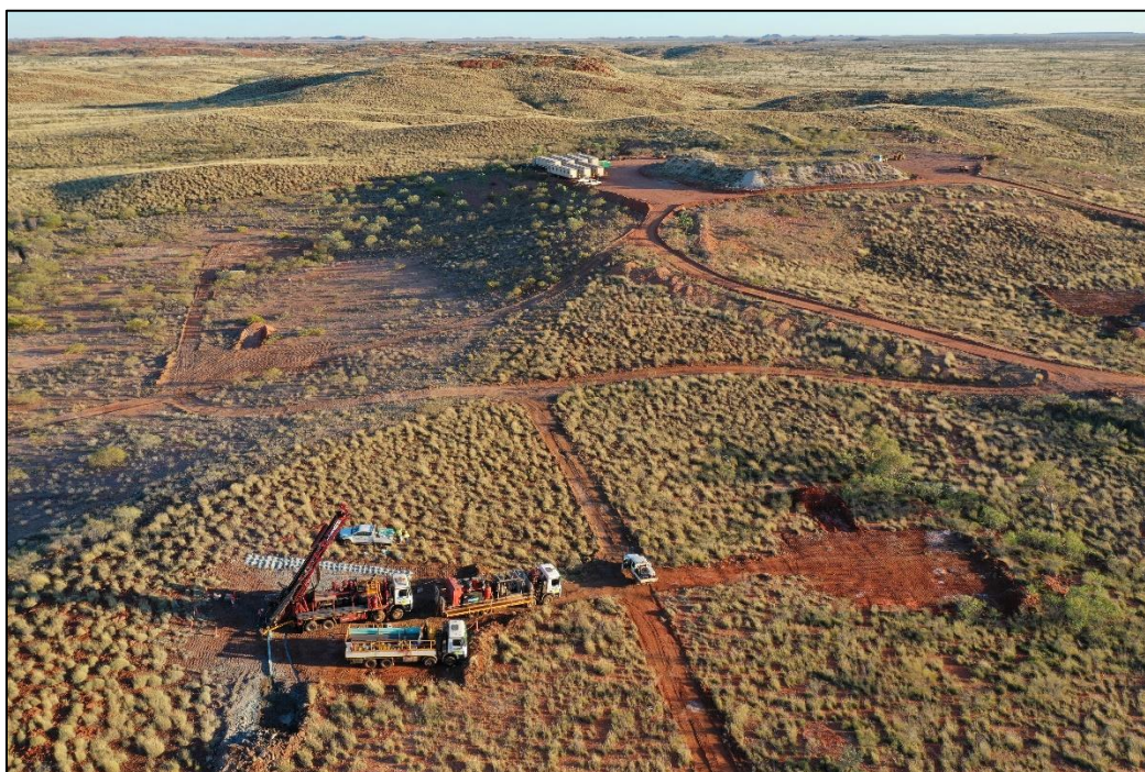
Figure 1 – RC drilling at Tabbatabba, with the field camp in the background (looking north).

Wildcat Resources Limited (ASX: WC8) ("Wildcat" or the "Company") is pleased to announce that RC drilling is underway at the Tabbatabba Project 1 (Figure 1) near Port Hedland, WA. The initial program is targeting the outcropping pegmatites 2 in the northern and central Mining Leases.