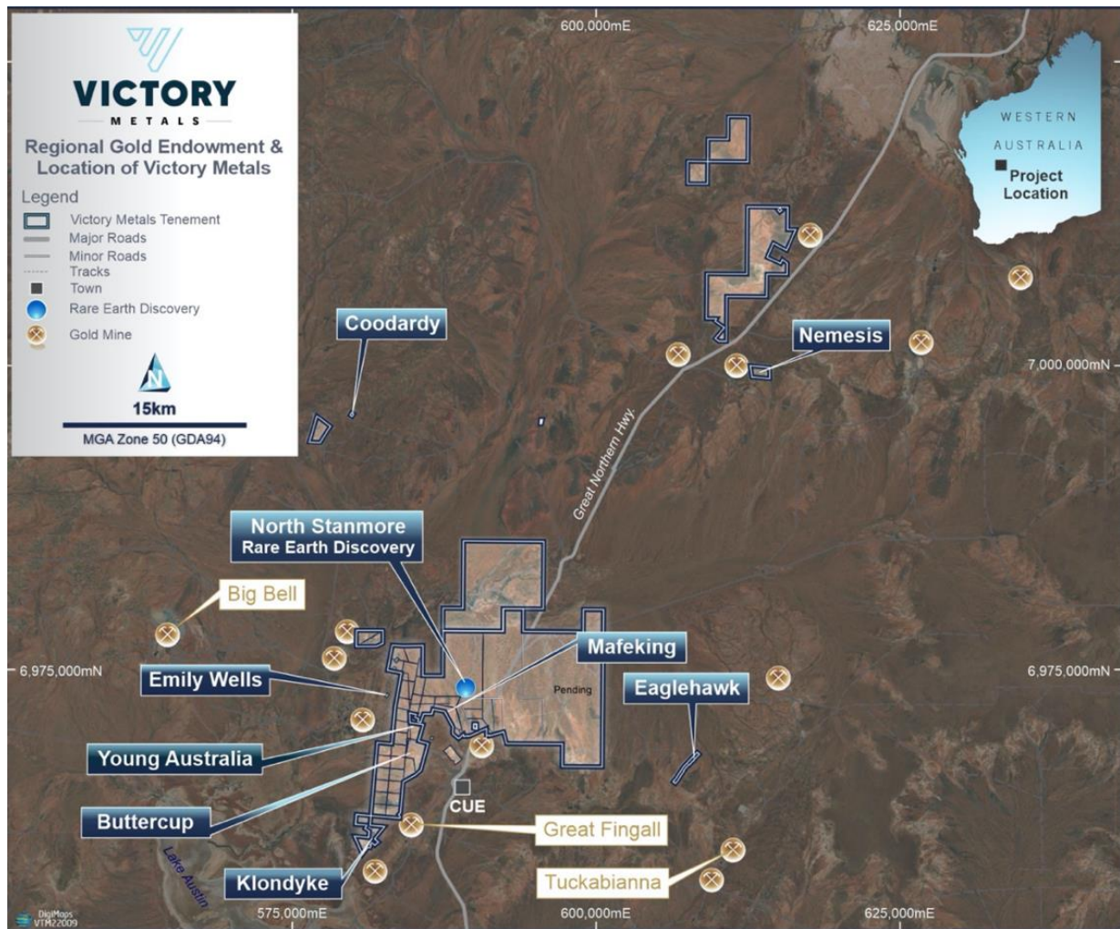
Figure 3. Regional Map showing Victory Metals tenement package and pending tenements.

from Perth. Victory's Ionic clay REE discovery is rapidly evolving with the system demonstrating high ratios of Heavy Rare Earth Oxides and Critical Magnet Metals NdPr + DyTb.