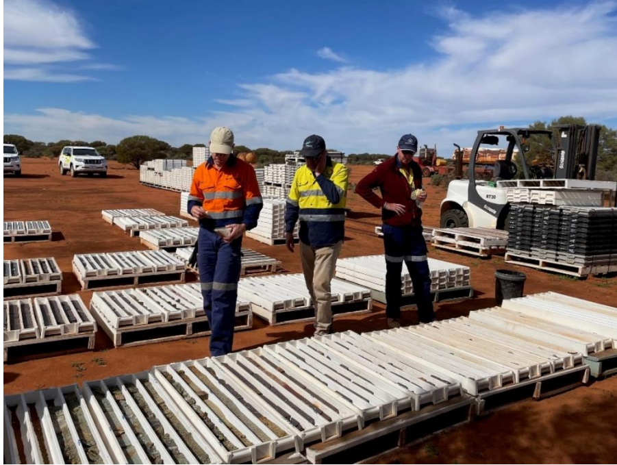
Figure 1 SRK team inspecting drill cores at the Murchison Technology Metals Project.