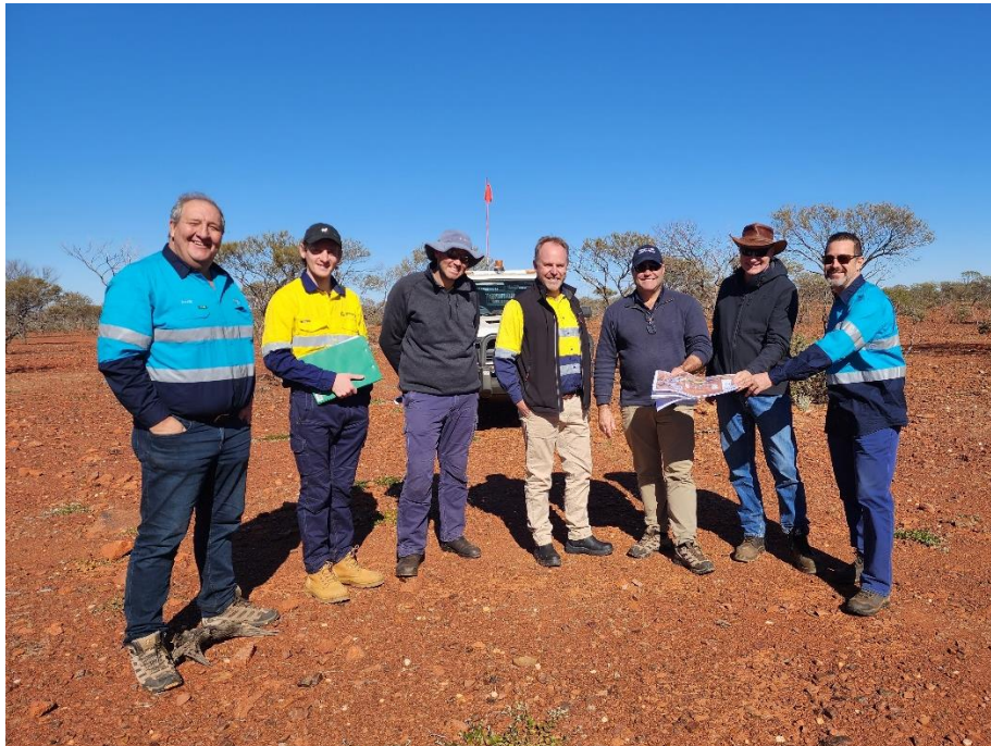
Figure 2 TMT representatives with the EPA team at the Murchison Technology Metals Project.