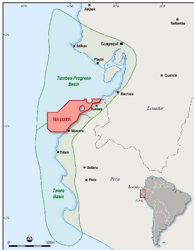
Fig 1. Tumbes-Progreso and Talara Basins

The Company and Jaguar have been considered as a “Qualified Subjects” by Perupetro (the Peruvian national oil regulator) and can now assume obligations for one hundred percent (100%) participation in a Technical Evaluation Agreement (CET) on area LXXXVI, subject to formal contracts being entered into between the parties and Perupetro which is expected to occur by the end of July 2023.