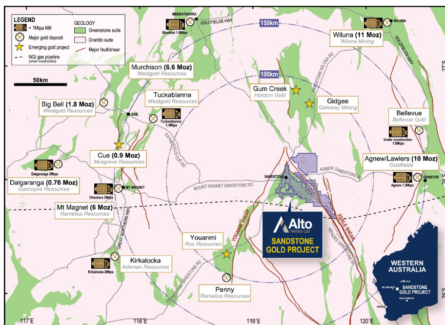
Figure 2. Location of Sandstone Gold Project within the East Murchison Gold Field, WA.

The Sandstone Gold Project covers ~740km 2 of the Sandstone Greenstone Belt and currently has an optimised, open-pit constrained mineral resource estimate of 832,000oz gold at 1.5g/t, capturing over 80% of the unconstrained total MRE of 1.05Moz. Alto is currently focused on growing these resources through continued exploration success and new discoveries.