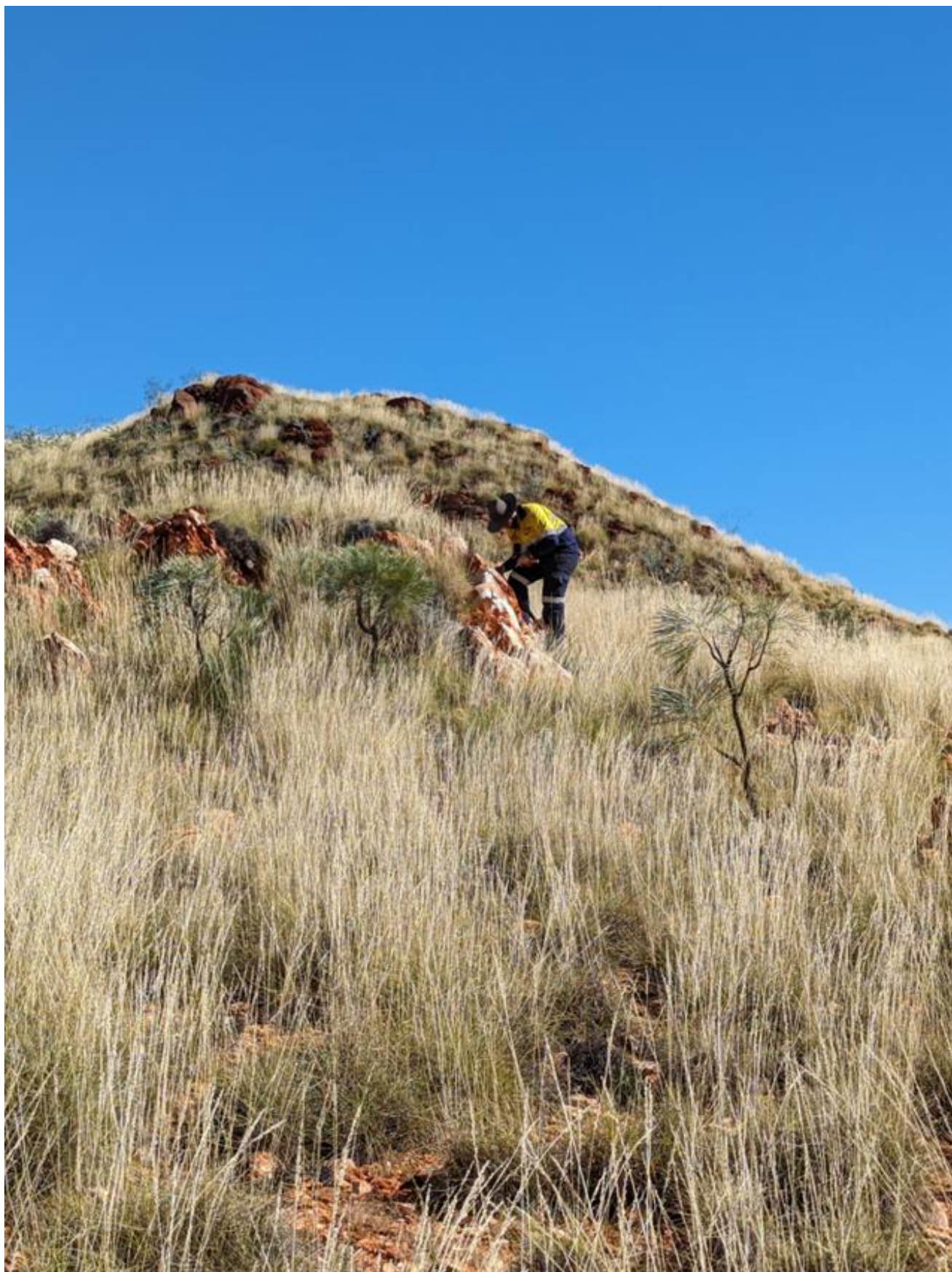
Figure 3. Sampling Pegmatite Outcrop at Rock Sample Site 23CR038