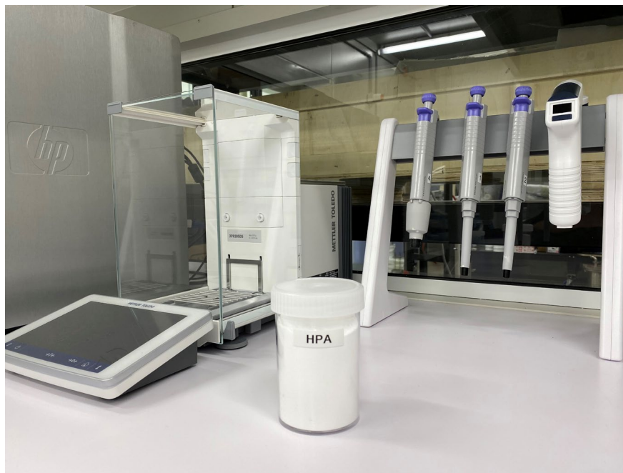
Figure: Sample from which material from analysis tabulated above was drawn in the QUT laboratory.

Both QPM and Lava Blue are excited to have achieved 4N HPA during the commissioning phase of this project. Lava Blue will continue to operate the Demonstration Plant with a target of producing 60 kg of 4N HPA. The operation of the Demonstration Plant is also providing valuable technical information for the design of commercial scale plant.