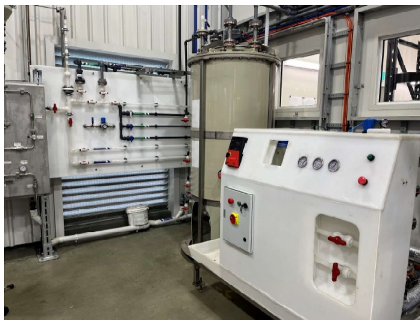
Figure: Crystallisation unit

QPM is also seeking to actively engage with potential HPA customers. It has recently appointed an in-house Technical Marketing Manager who will drive these efforts in conjunction with external HPA marketing experts. The samples from the Demonstration Plant will be critical to customer engagement.