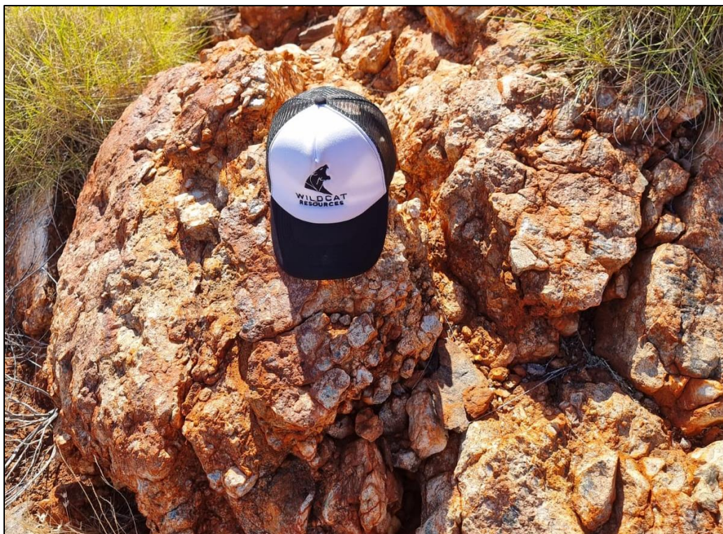
Figure 1 – Numerous additional pegmatite outcrops have been identified at Tabba Tabba