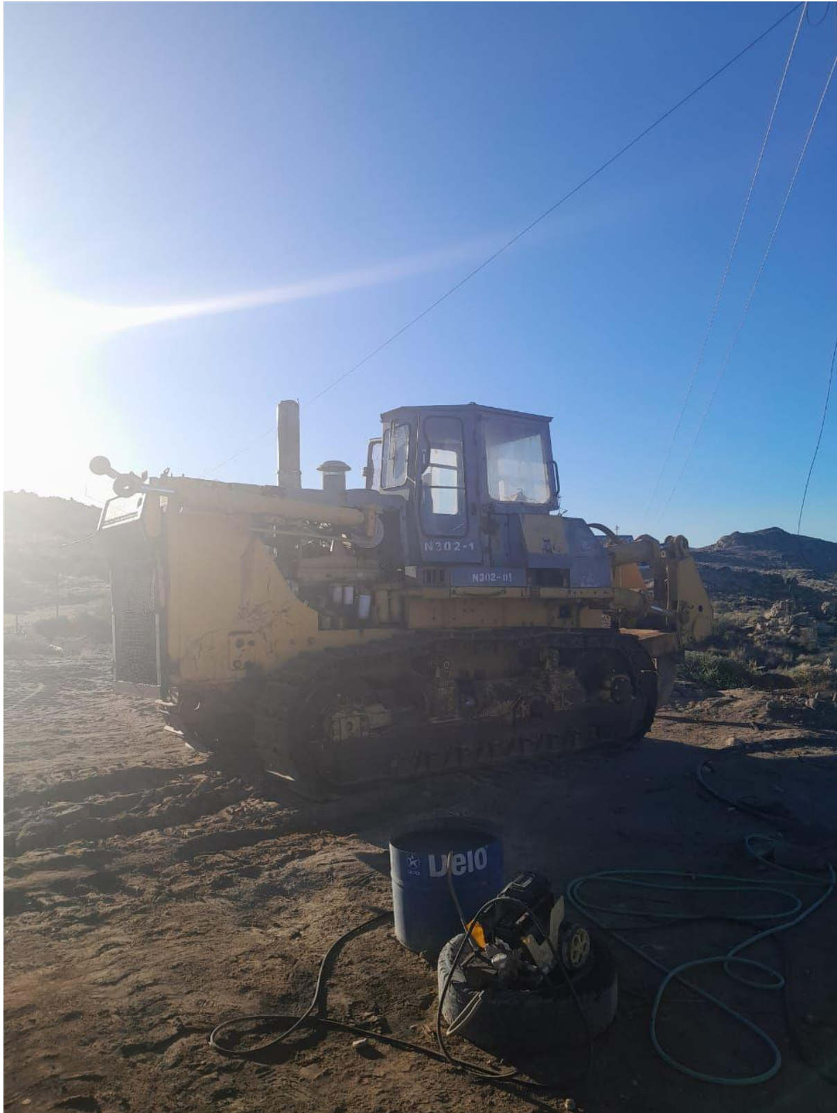
Figure 5 – Dozer used to clear rocks and tree roots in the vicinity of the roads