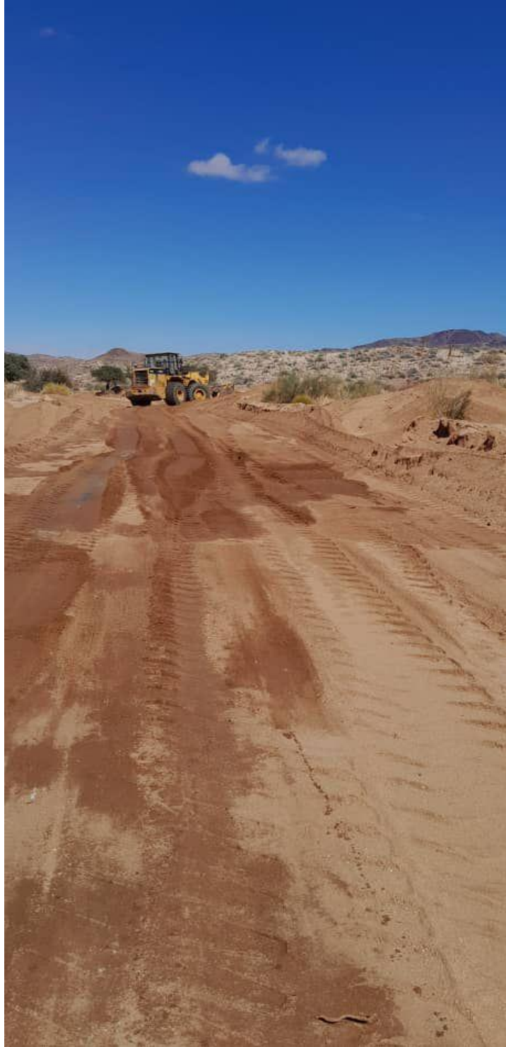
Figure 3 – Road construction to the plant location.