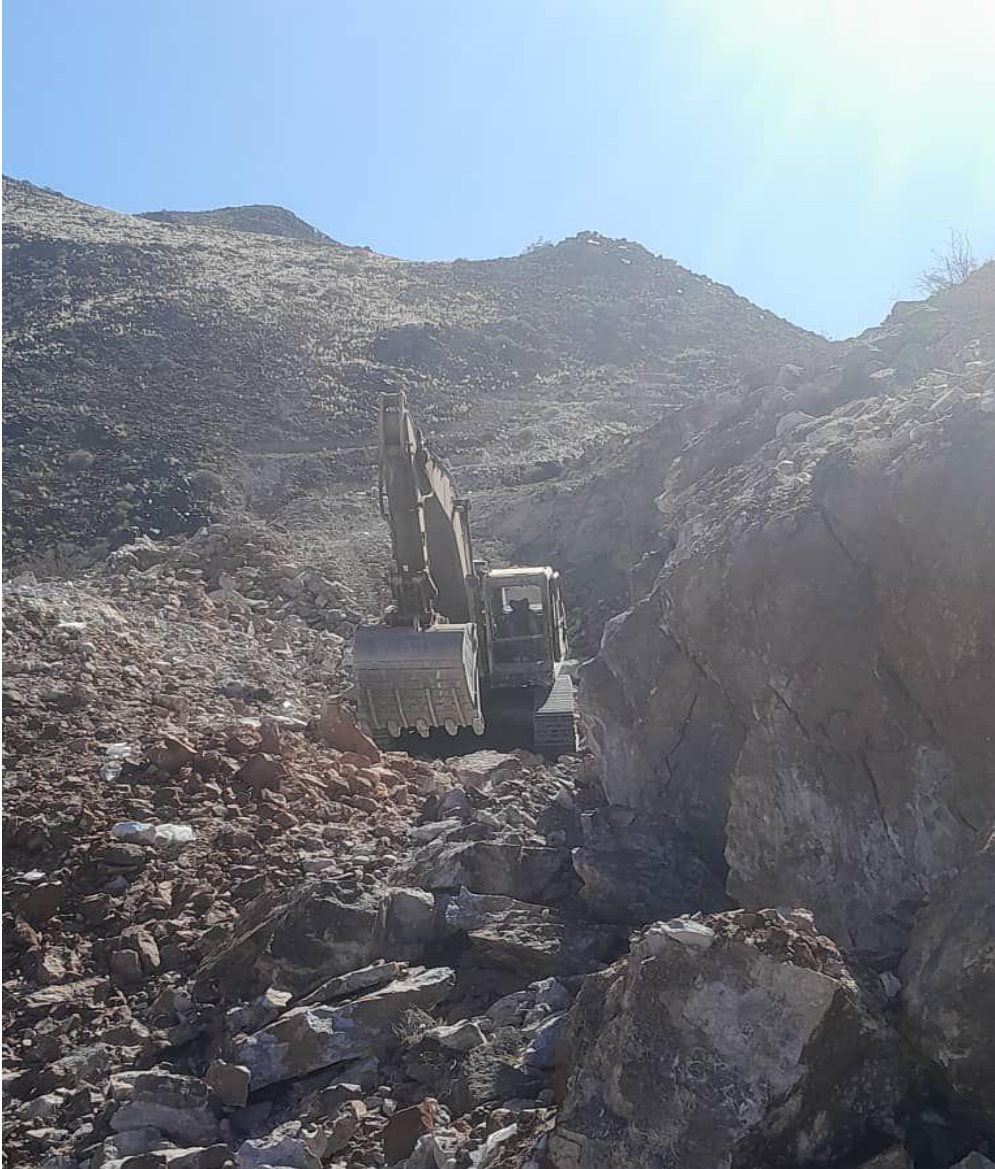
Figure 2 – Road construction in progress