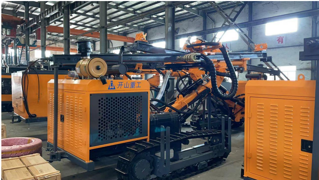
Figure 6 – Drill machine ordered