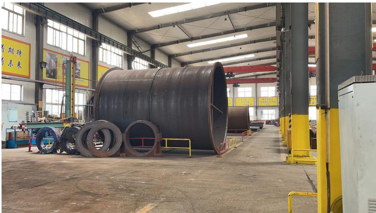
Figure 7 – Ball mill ordered