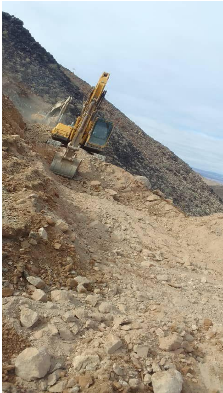
Figure 1 – Roadworks being undertaken between the Swanson mine site and the location of the plant.