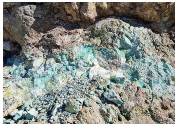
Plate 2: Firetail Board site visit to Picha Copper Project in Peru