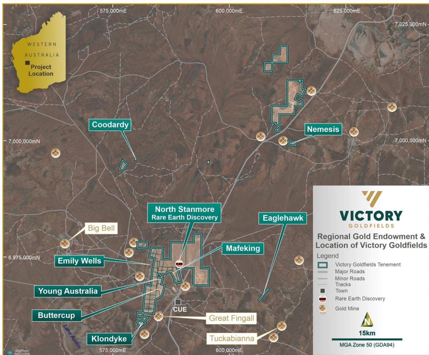
Figure 2. Regional Map showing Victory's tenement package

This announcement has been authorised by the Board of Victory Goldfields Limited.