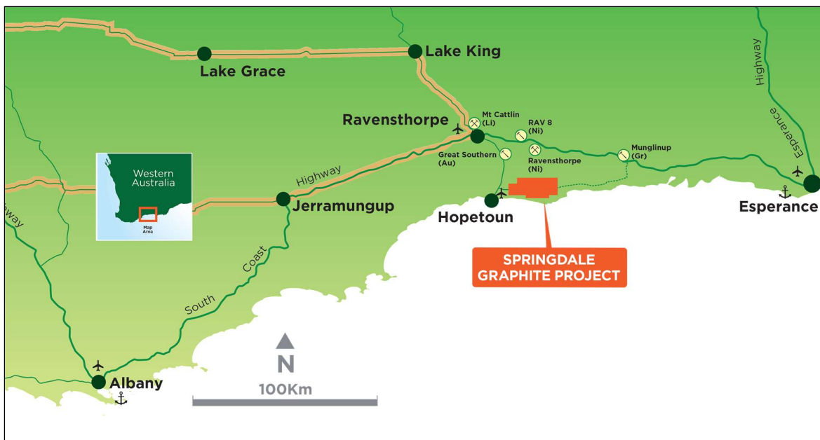
Figure 1: Location of International Graphite projects

Drill collar data from drilling to date is shown below in Table 1 and visual graphite intercepts from drilling completed to date are shown in Table 2 and also Figure 2 for SGRC0088.