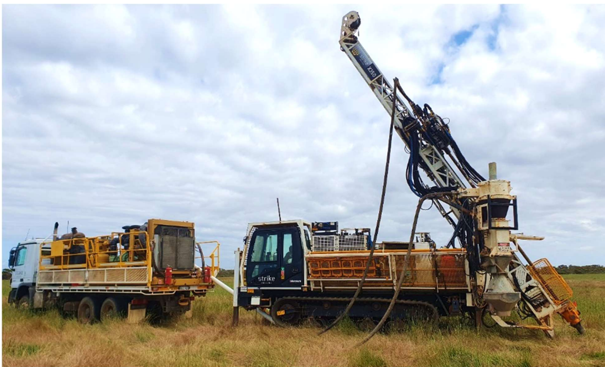
Figure 4: Drilling at Springdale