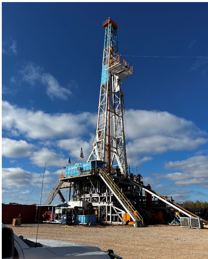
Figure 1. Latshaw Drilling Rig 12, drilling ahead on the Wolf Pack Well location, Stephens County, Oklahoma

Perth, Western Australia – Brookside Energy Limited (ASX: BRK) (OTC Pink: RDEF) (Brookside or the Company) is pleased to provide shareholders and investors with an update on operations from Brookside's Phase Two development drilling in the SWISH Area of Interest (AOI) in the world-class Anadarko Basin, the high-impact Wolf Pack 36-25-1S-4W SXH 2 Well (Wolf Pack Well) (Figures 1 and 2).