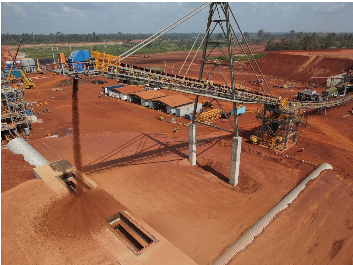
Figure 1: Abujar Gold Project is on track for first gold in December 2022

West African gold explorer and developer Tietto Minerals Limited (ASX: TIE) ( Tietto or the Company ) is pleased to provide the first project commissioning update for its fully funded 3.45Moz Abujar Gold Project in Côte d'Ivoire, West Africa. Tietto is on track to deliver first gold at Abujar in December 2022.