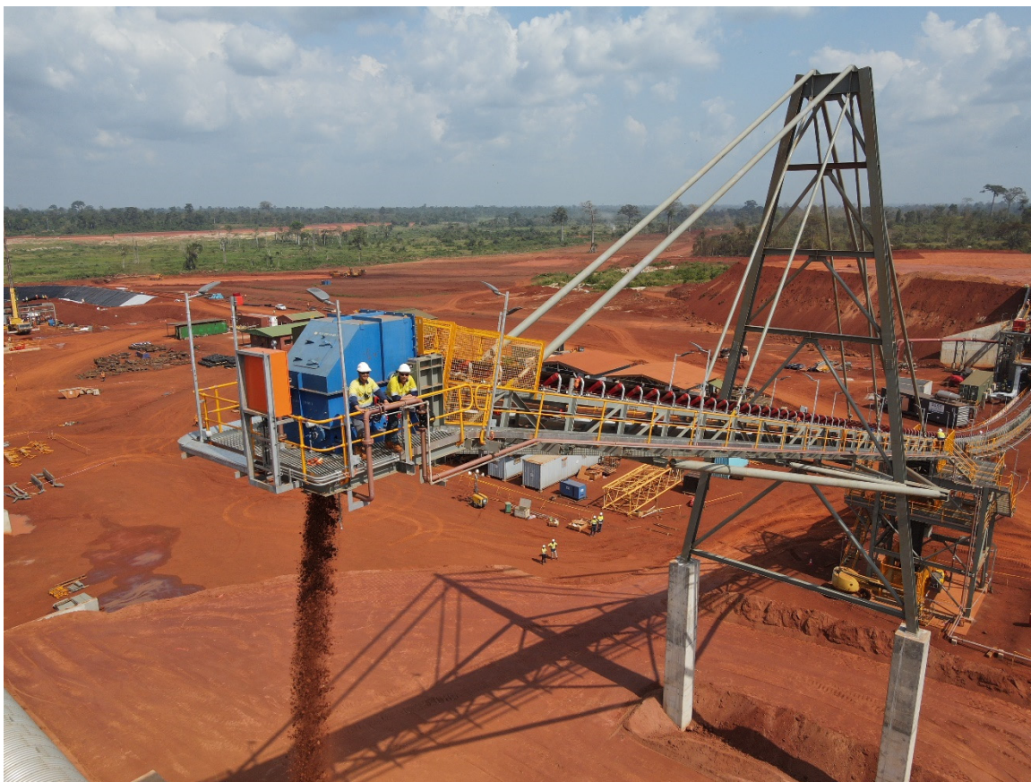
Figure 4: Crusher circuit commissioning