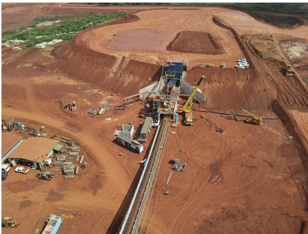
Figure 5: Crusher circuit commissioning