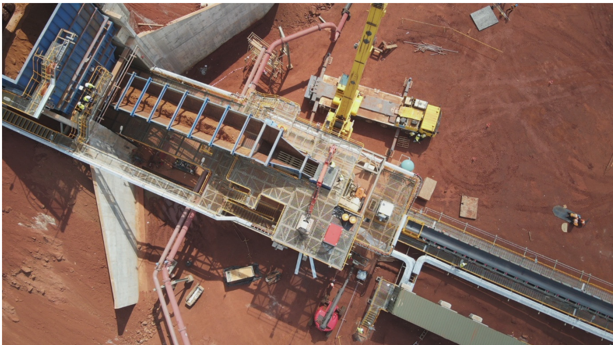
Figure 3: Crusher circuit commissioning