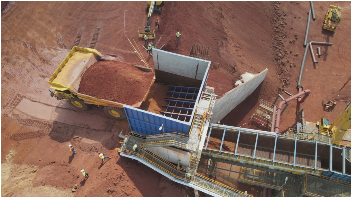
Figure 2: Crusher circuit commissioning

Tietto has commissioned the crushing circuit and will build a crushed ore stockpile while the focus is on commissioning the rest of the plant. The following figures show the crusher commissioning.