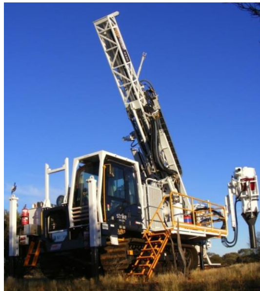
Figure 2: Strike Drilling X350 AC/RC Drill Rig

The agreement provides for mobilisation costs as the rig is currently in WA, which will be shared by the parties, and a schedule of rates for drilling and other activities, to be paid by the party using the rig. The rig is expected to arrive in the Lachlan Fold Belt in February 2021, will commence drilling on Argent's ground and will then be available to MinRex in April 2021. MinRex is close to finalising the exploration program for its recently acquired Lachlan Fold Belt land and will provide an update in due course.