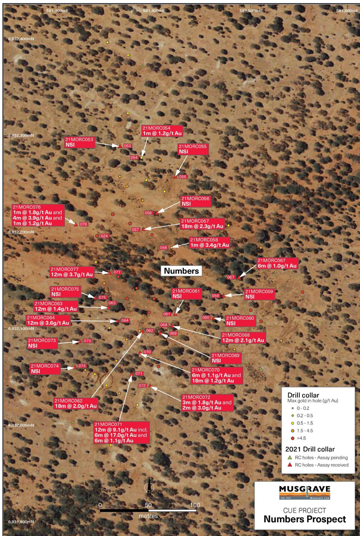
Figure 4: Drill hole location plan for Numbers prospect