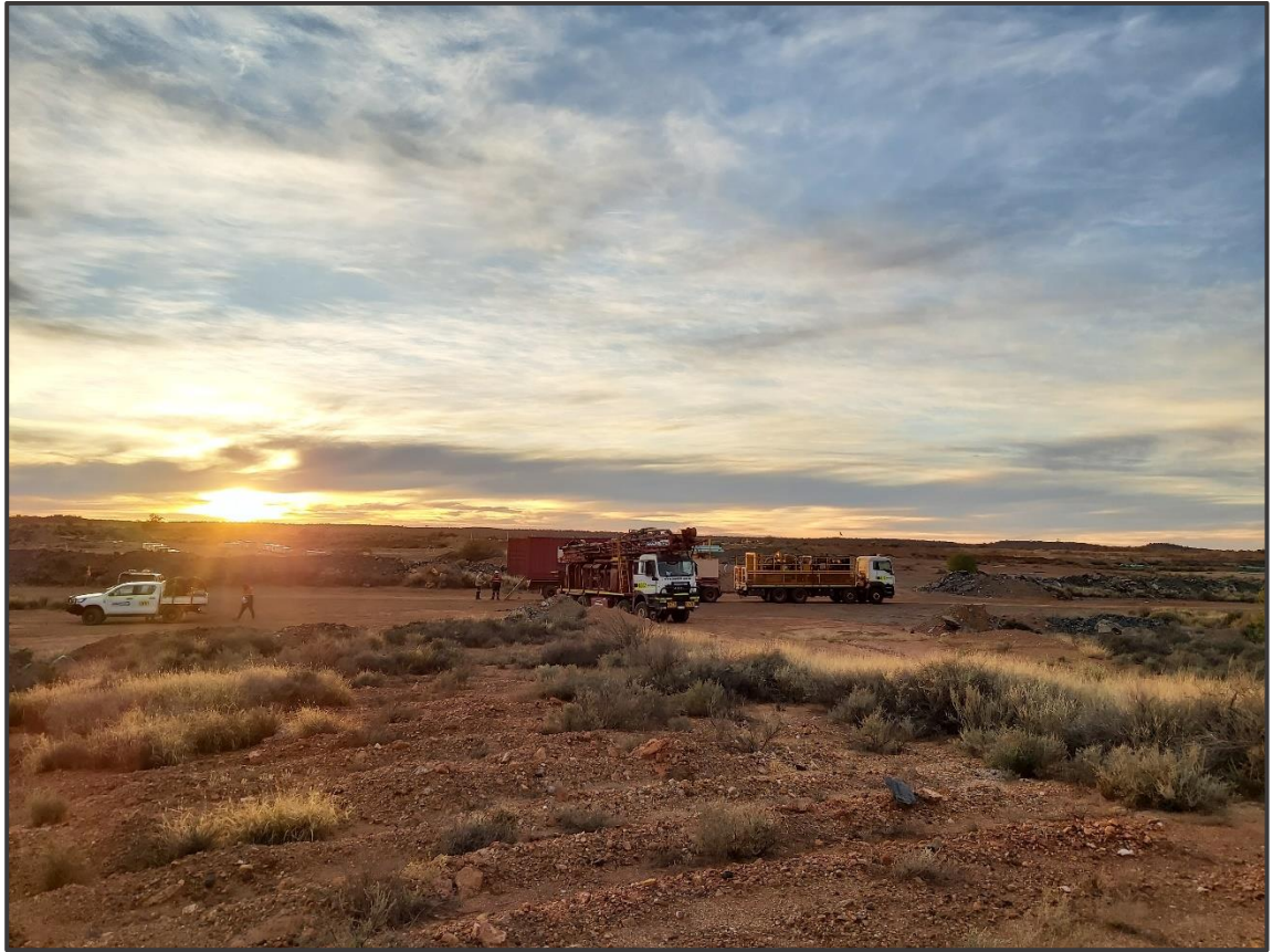
Figure 1: Topdrill RC rig setting up to start drilling at Lady Shenton