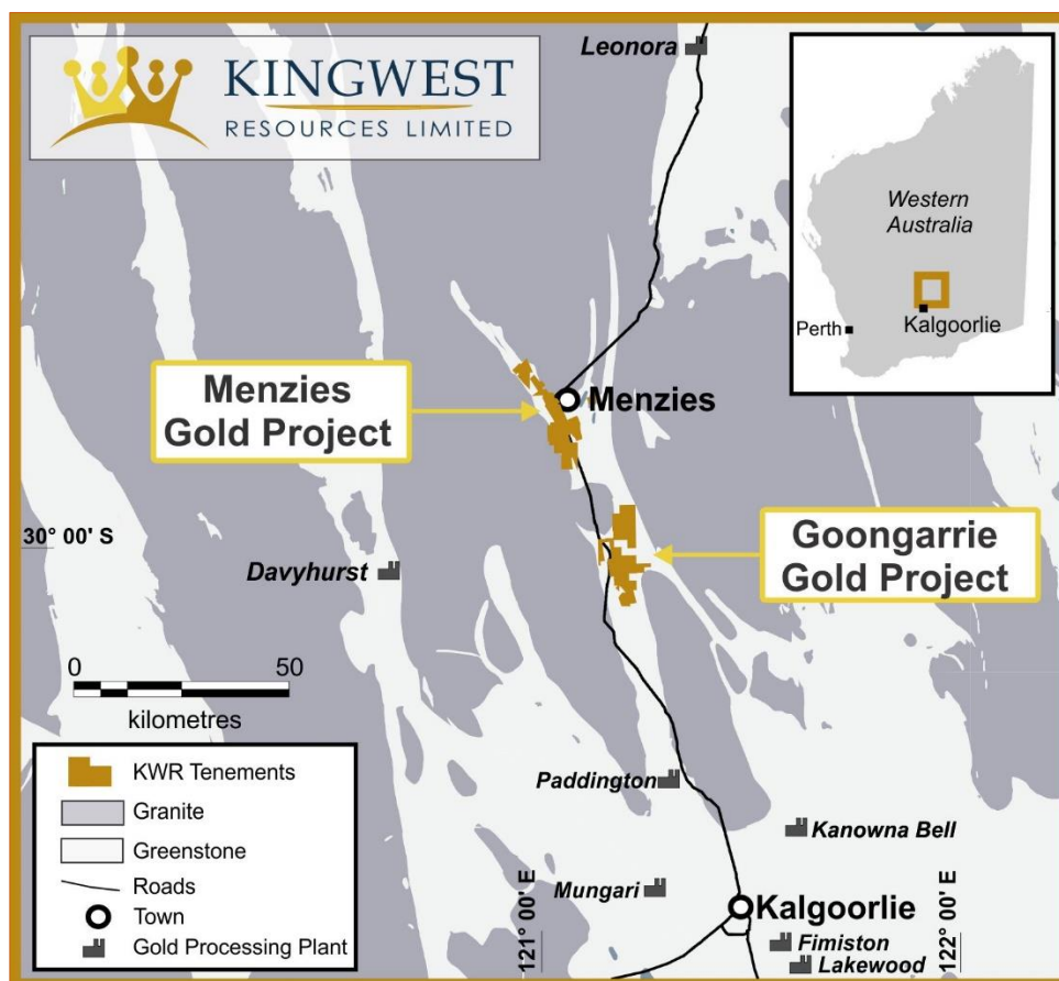
Figure 3: MGP and GGP locations

Importantly the MGP lies on the Goldfields Highway, has power and water and is within trucking distance of numerous Gold Processing Plants.