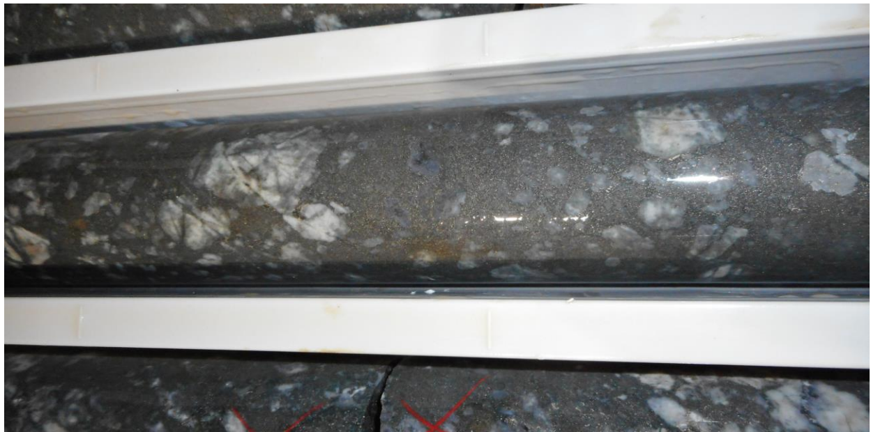
Figure 2: CBDD054 at 362m (above the broad 37.2m Ni-Cu-Fe sulphide zone) showing non-nickeliferous sulphide droplets within the matrix of a silica layer. This layer forms the basis of sulphide transport within the feeder-zone from assimilation points, where the pyroxenite intersects and exhumes sulphidic country-rock. Turbidity at the T5 trap site occurring from changes in the topography of the intrusion liberates the sulphides from this layer, thereby exposing them to metals such as nickel and copper within the pyroxenite. They then can accumulate on the basal contact as massive Ni-Cu sulphides.

This local understanding can now be applied to the latter Phase 3 and Phase 4 step-out drilling that will be occurring over the next few months. It places the company in a good position to recognise the significance of certain geological aspects that can vector into additional massive sulphide target areas outside of the main T5 Conductors.