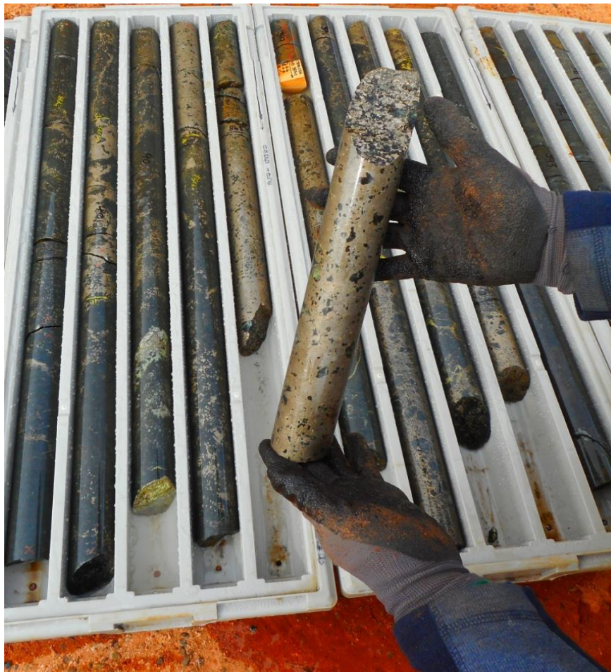
Figure 1: Massive nickel-copper-iron sulphide breccias in CBDD054 at 396m on the T5 basal contact

Estrella Resources Limited (ASX: ESR) (Estrella or the Company) is pleased to announce it has intersected 6.75m (1) of massive nickel-copper-iron sulphides within a broad zone of sulphide rich mineralisation at the Company's 100% owned Carr Boyd Nickel-Copper Project, located ~80km north of Kalgoorlie. This large massive nickel-copper-iron sulphide intersection at the T5 discovery continues the 100% strike rate for nickel-copper-iron sulphides in the Phase 3 diamond drilling program.