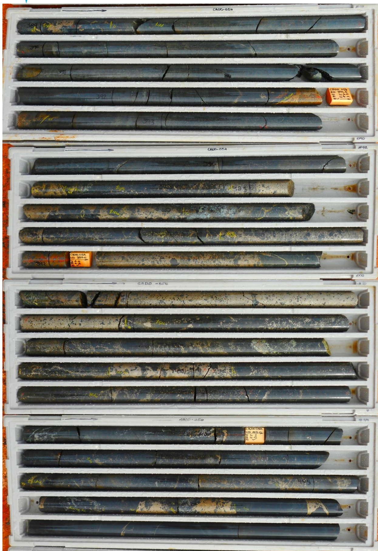
Figure 5: Massive sulphide breccia mineralisation within CBDD054