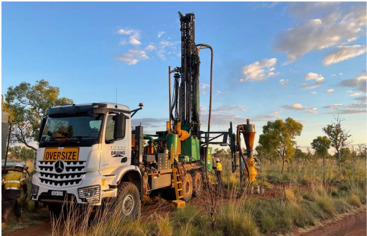
Figure 1: Drill rig on site at Cummins Range for 2021 drill campaign

The 2021 drill program will comprise over 3,000m of reverse circulation (“RC”) drilling and 3,000m of diamond drilling, to be undertaken by both Stark Drilling and ASX-listed DDH1 Drilling. The program is expected to take 3-4 months to complete.