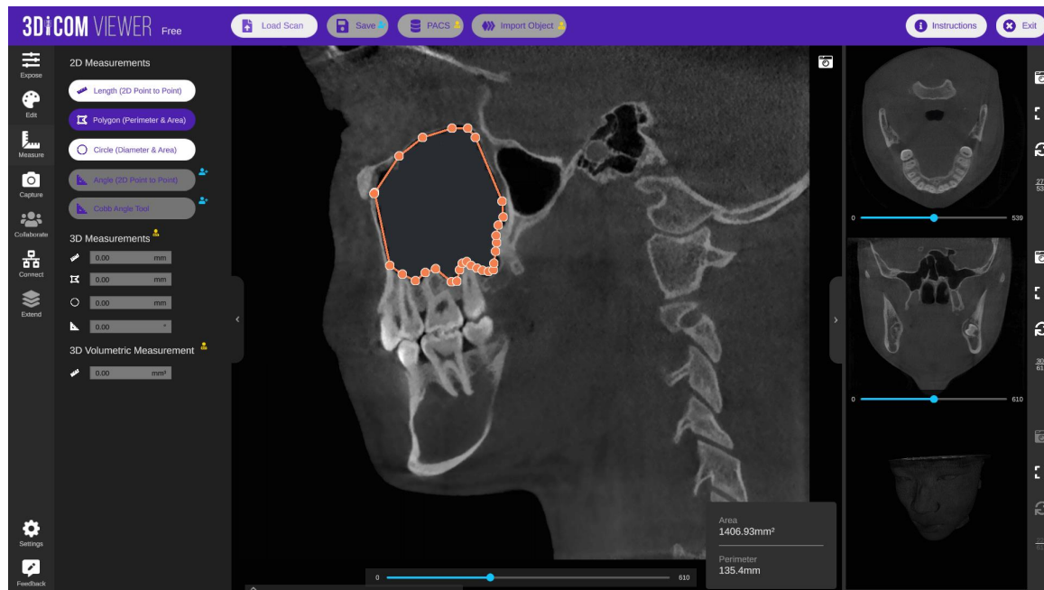
Figure 1 3Dicom displays advanced 3D volume rendering and multi-planar reconstruction as standard

Following the inclusion of all Pro & Surgical features by July 2021, the Company intends to seek FDA 510(k) and TGA Class II approvals as a Diagnostic software which will accelerate enterprise sales to healthcare providers, radiological clinics and hospitals. It is anticipated that the FDA 510(k) approval shall also be sought for the Company's spinal segmentation module for its inclusion in 3Dicom & MedVR.