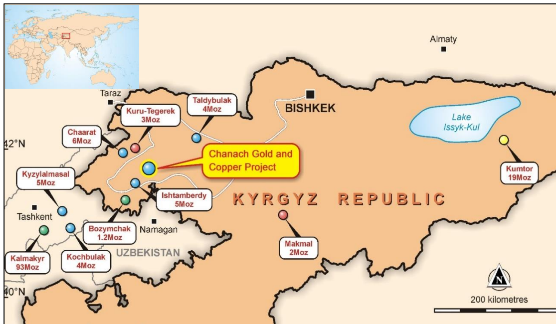
Figure 2: Chanach Project Location

To date the limited exploration activities have defined an Inferred Mineral Resource of 2.95 Mt @ 5.11 g/t Au for 484,000 ounces of Au and 17.23 Mt @ 0.37% Cu for 64,000t of Cu.