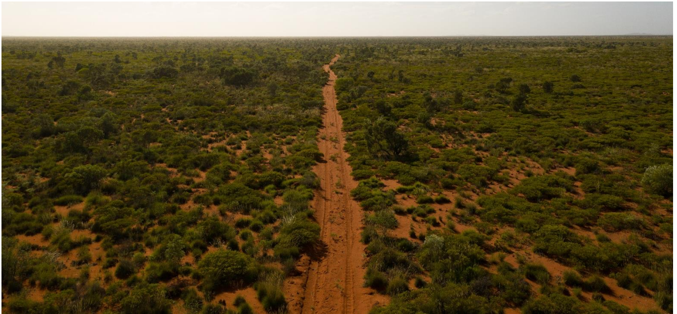
Figure 5: Main Roberts Hill access track

During the quarter, the Company submitted its Program of Work (PoW) to the Department of Mines, Industry Regulation and Safety (DMIRS) for the proposed Roberts Hill drilling program of 19,500 metres of air-core drilling. Delays have been encountered with the approval of the PoW due to some of the drilling locations requiring extra environmental care when drilling within affected parts of the Yule River water catchment. The Company will update the market as information comes to hand in respect to the Program of Work approval and other relevant approvals.