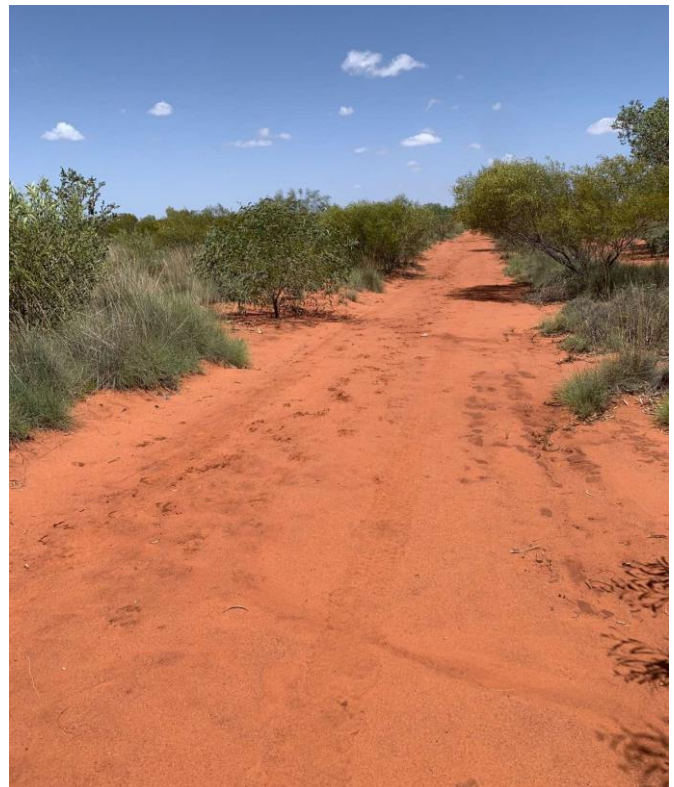
Figures 4 (left) and 5: All aeromagnetic features are covered by at least 40 metres of sand cover. New tracks as well as track repair are proposed.