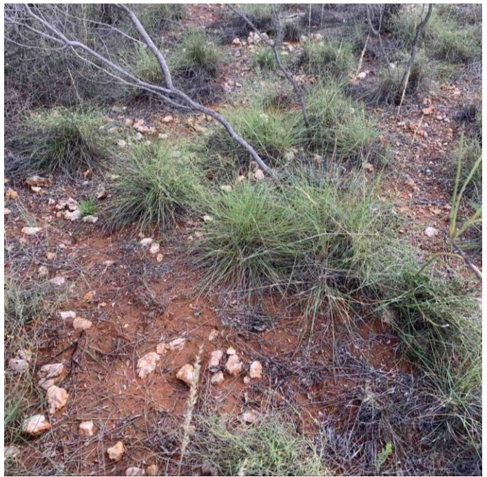
Figures 2 (left) and 3: Sparse occurrences of calcrete development within the Roberts Hill tenement

The Roberts Hill Exploration Licence is situated in the highly prospective Mallina Basin and is located only 6km from De Grey Mining Limited's (ASX: DEG) flagship Hemi discovery. Work done by previous explorers has been limited to one water bore drill hole and sporadic soil sampling. Caeneus will be the first Company to drill test the aeromagnetic intrusive features recently identified in this property, with its planned 2021 drilling program.