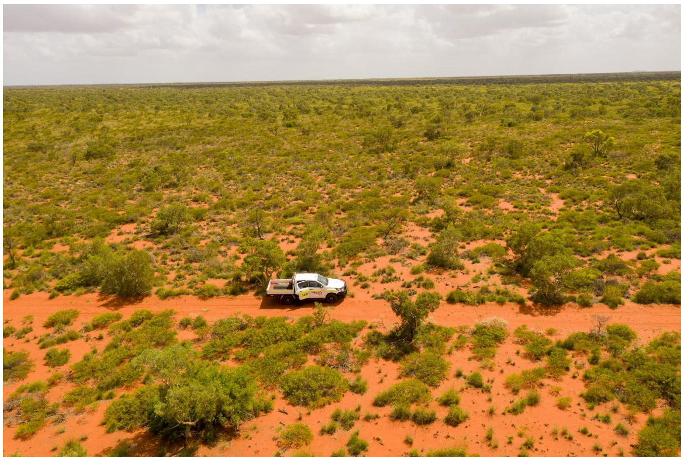
Figure 1: Drone photo showing typical Roberts Hill topography

During the quarter, the Company has been completing field trips in preparation for its maiden drill program on its Roberts Hill Project. Proposed drill sites have been inspected and a full review of all proposed track clearing requirements has been completed.