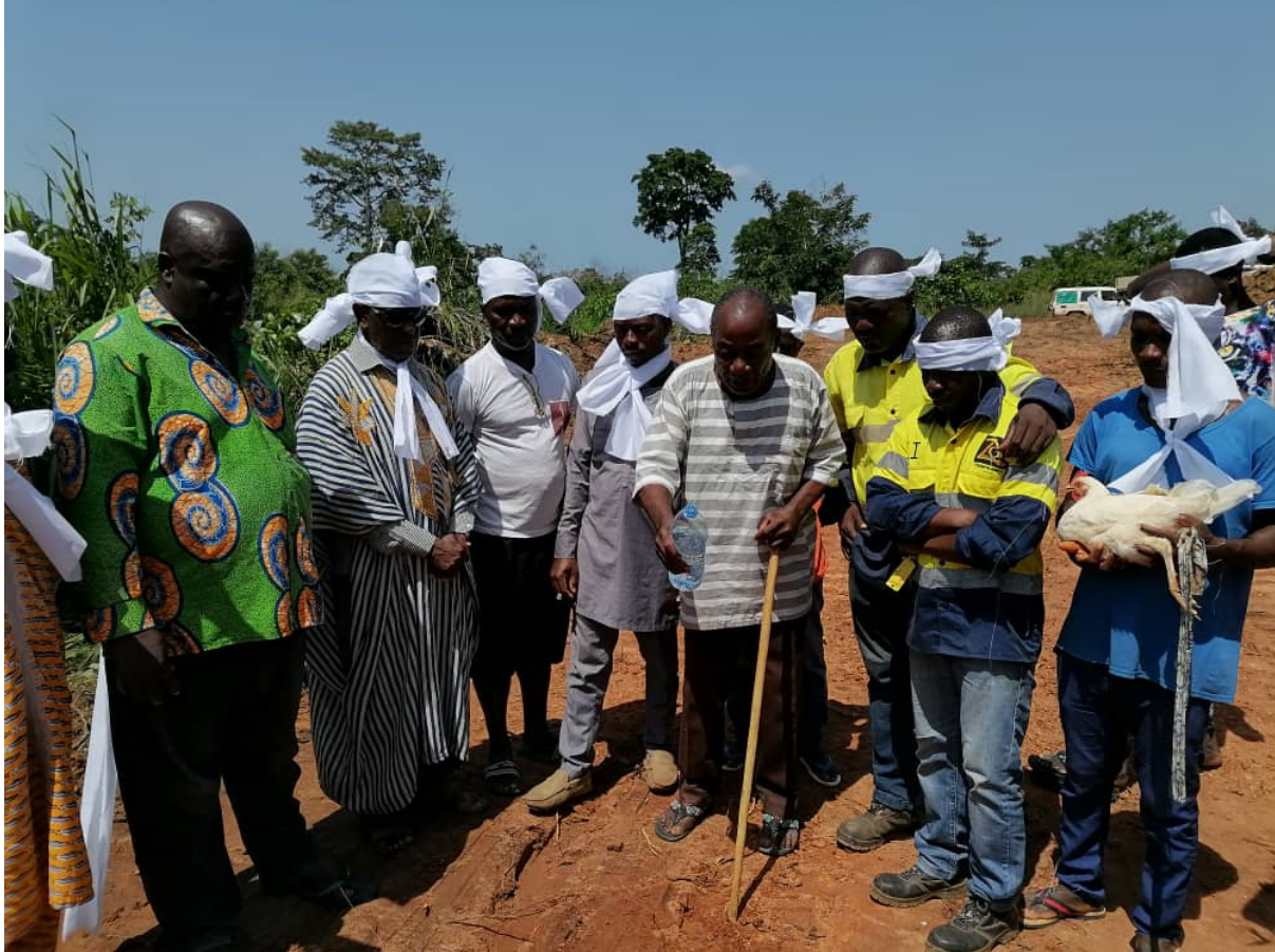
Figure 3: Traditional libation at the Zoukpangbeu community prior to ground disturbance

Tietto recognises the significance of local culture and customs and has always paid great respect to communities surrounding its projects. It held a libation ceremony with Zoukpangbeu community leaders prior to the first ground disturbance, as shown in Figure 3.