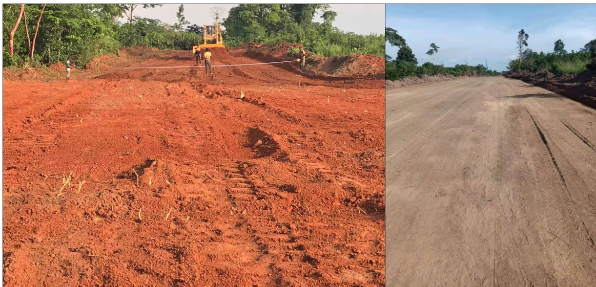
Figure 2: Abujar site access upgrade work