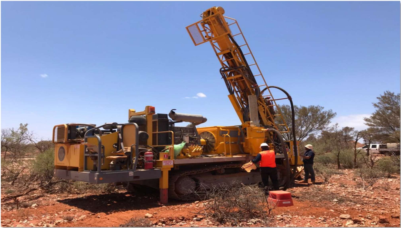
Figure 3: Drill rig onsite at Marymia Project, July 2020