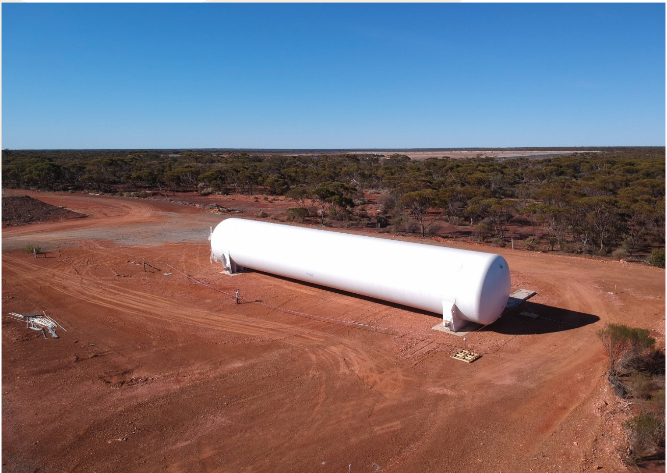
LNG gas storage bullet in position at Davyhurst

Gas storage bullet for power station gas supply which was constructed in China has been delivered to site.