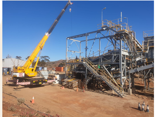
Screen house pulled down ahead of installation of new and improved double screen deck