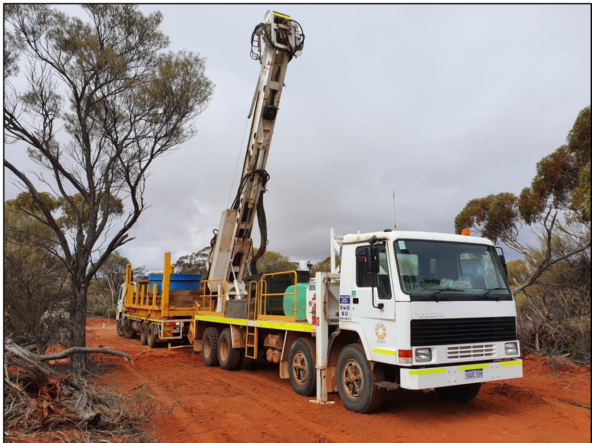
Figure 2. Topdrive Drillers Australia diamond drill rig and rod carrying service truck over CBDD028 collar location Target 5 prospect area Carr Boyd Nickel Project

Estrella has been actively exploring the Carr Boyd Nickel Project (CBNP) since October 2017 and in 2019 the Company discovered new nickel-copper sulphide mineralisation at its T5 target, approximately 1km NNW of the Carr Boyd Mine (see ESR ASX releases on 28 May 2019 Nickel Copper Discovery at Carr Boyd Rocks and 8 July 2019 Assay Results Confirm New Sulphide Nickel Discovery Zone at Carr Boyd Rocks).