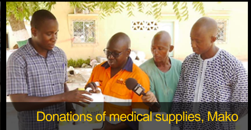
Donations of medical supplies, Mako