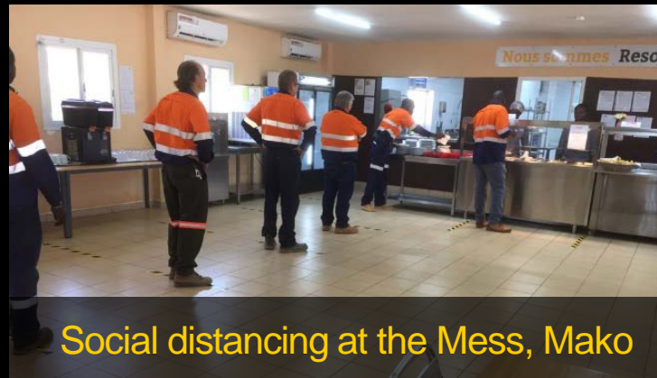
Social distancing at the Mess, Mako