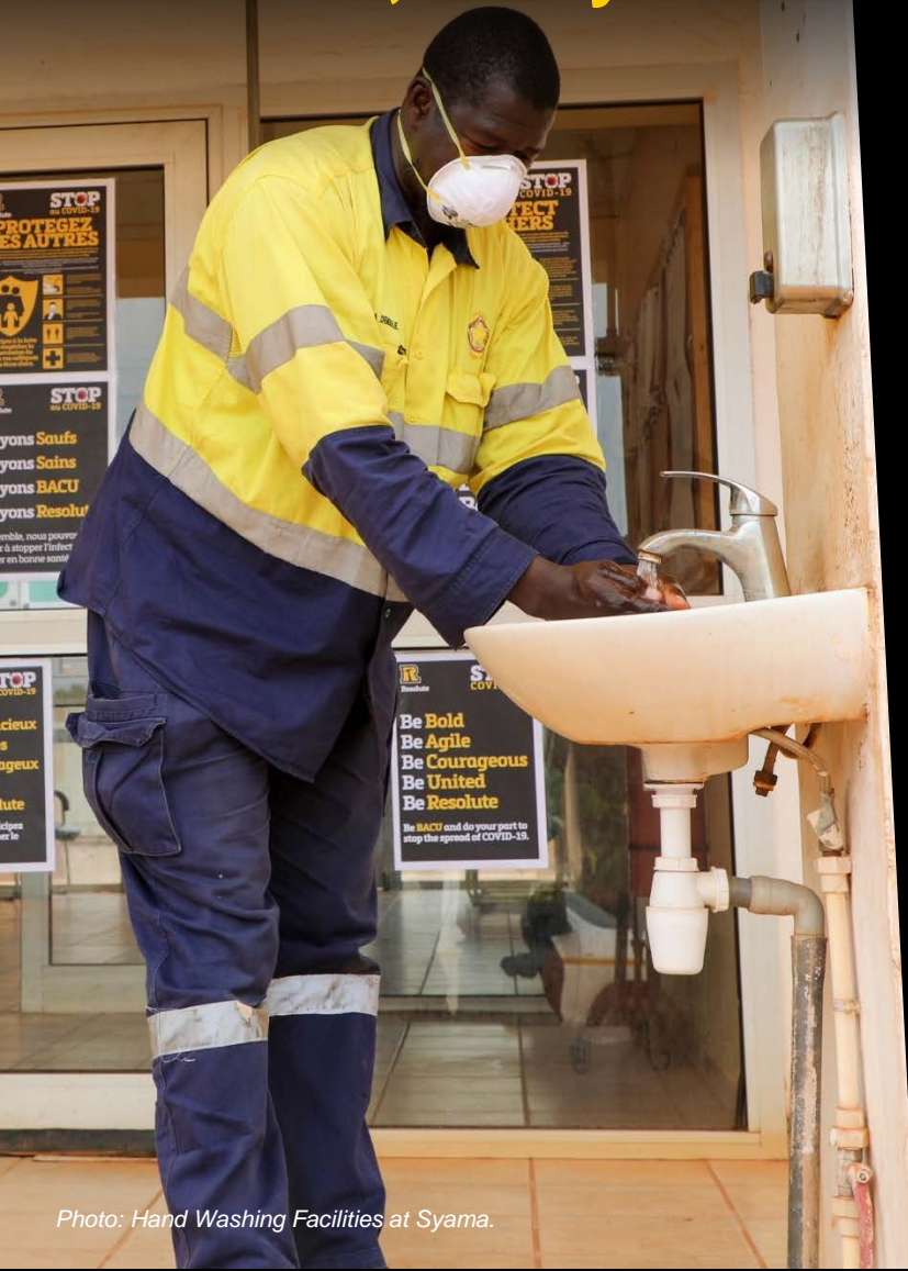
Photo: Hand Washing Facilities at Syama.