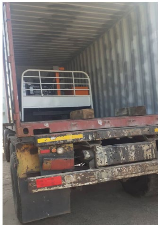
Auger rigs being loaded for shipping