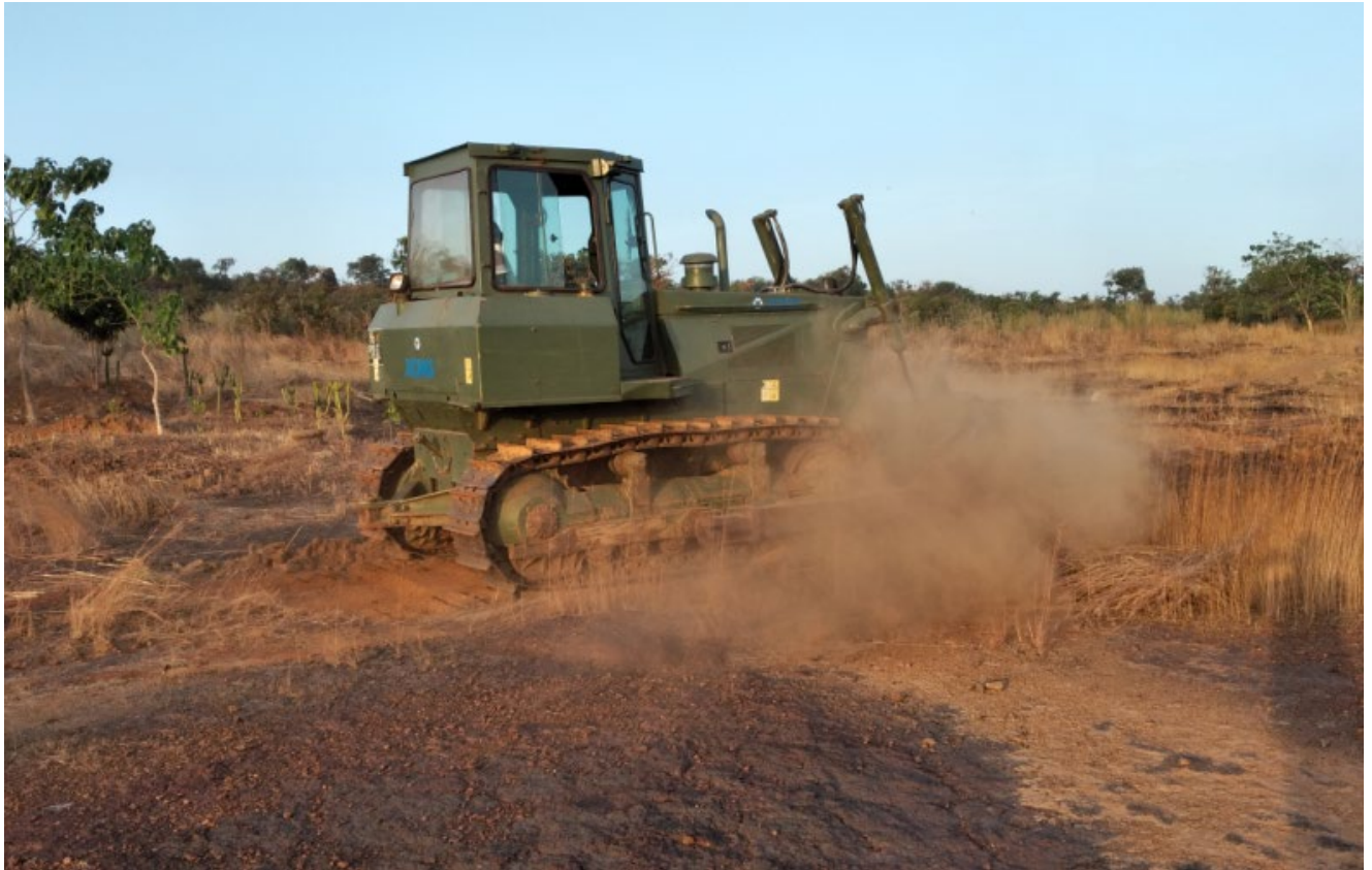
Access tracks and drill pads preparation activities at Kouroussa

As previously announced, the company will use its jointly owned power auger rigs to conduct the drilling program. The assembly of the two power auger rigs was completed last week and they are in transit to Guinea. A Guinea based third party company will operate and maintain the auger rigs which will be utilised for auger drilling programs being undertaken by Volt and the joint owner. It is anticipated that the jointly owned auger rigs will significantly lower the auger drilling costs across the Company's three Guinea gold projects.