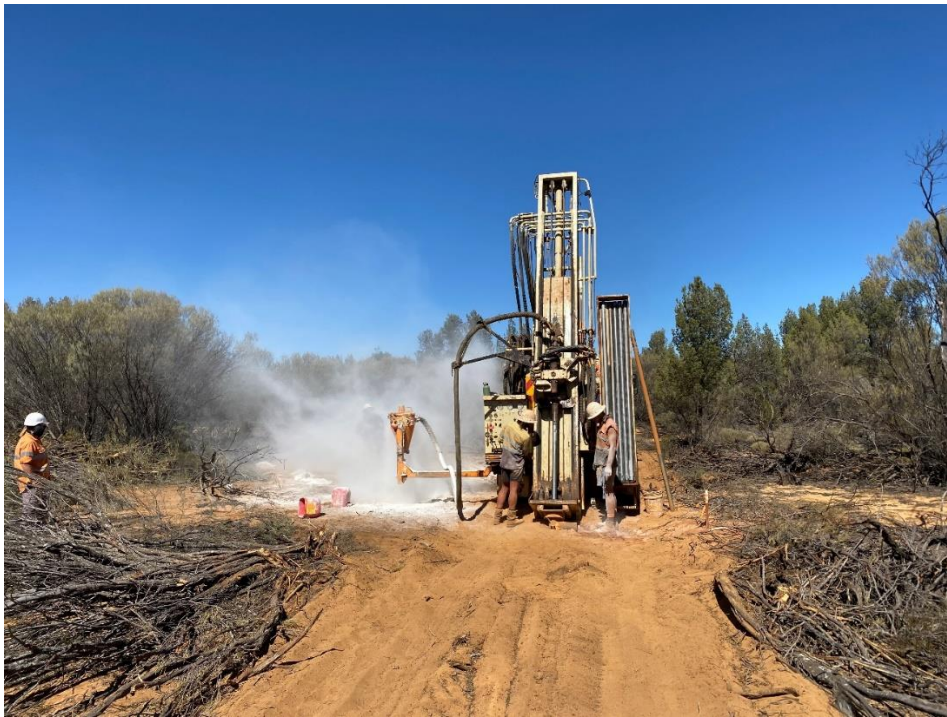
Figure 1: KTE Mining conducting Aircore drilling at the Bonanza Project

The Company plans to follow up the Aircore program with deeper Reverse Circulation (RC) drilling as soon as possible. Drilling will be focused on the northeast corner of the Bonanza Project nearest the Penny West Mine. Sabre is currently canvassing RC drilling contractors to conduct the program that could commence in the next four to six weeks. Additional Aircore drilling and/or Auger soil sampling may be conducted to test additional targets on the Bonanza and Beacon Projects.