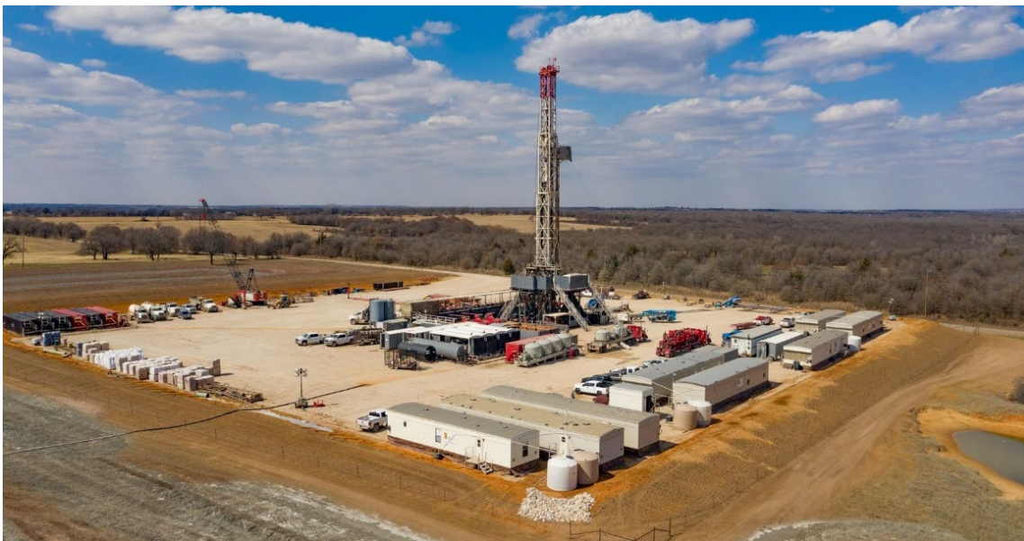
Figure 1. Kenai Rig 18 drilling the Flames Well

Drill to the intermediate casing point, set casing and cement in place. Land the curve leading into the lateral (horizontal) section of the well and drill lateral to target depth.