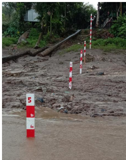
Water depth gauges installed at Batu Tuhup